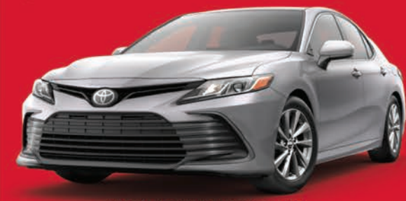
LEASES STARTING FROM..