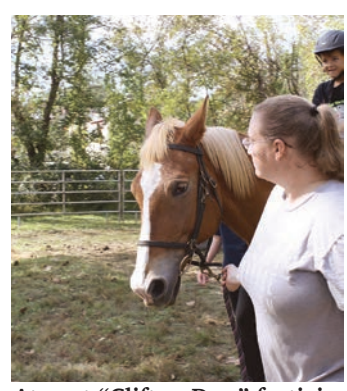
At past "Clifton Day," festivities, NVTRP provided rides to children in a small arena.

In order to meet the growing demand for NVTRP services, and provide an enhanced experience for current riders, their families, and volunteers, they are conducting a whole scale capital improvement project that will unleash property's full potential. Phase I, including the new, lit outdoor Trefry Riding Arena, expanded parking, acces-