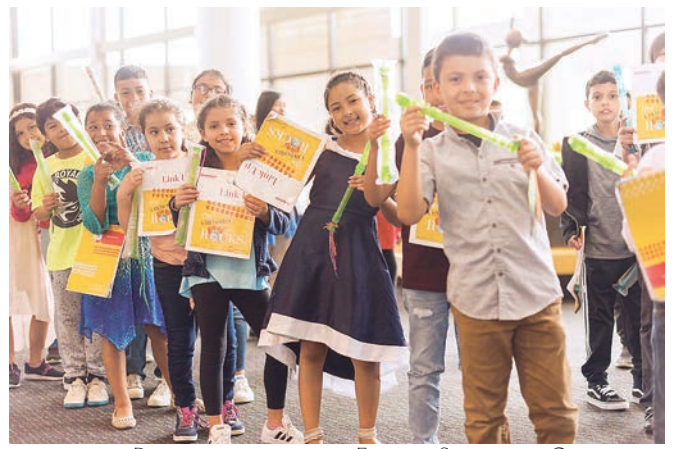
Students in Fairfax Symphony Orchestra "Link Up" 2019 music program

"These organizations show ways the creative spirit continues to thrive – whether through outdoor, virtual or digital programming," said Hunter A. Applewhite, president of the Dominion Energy Char-