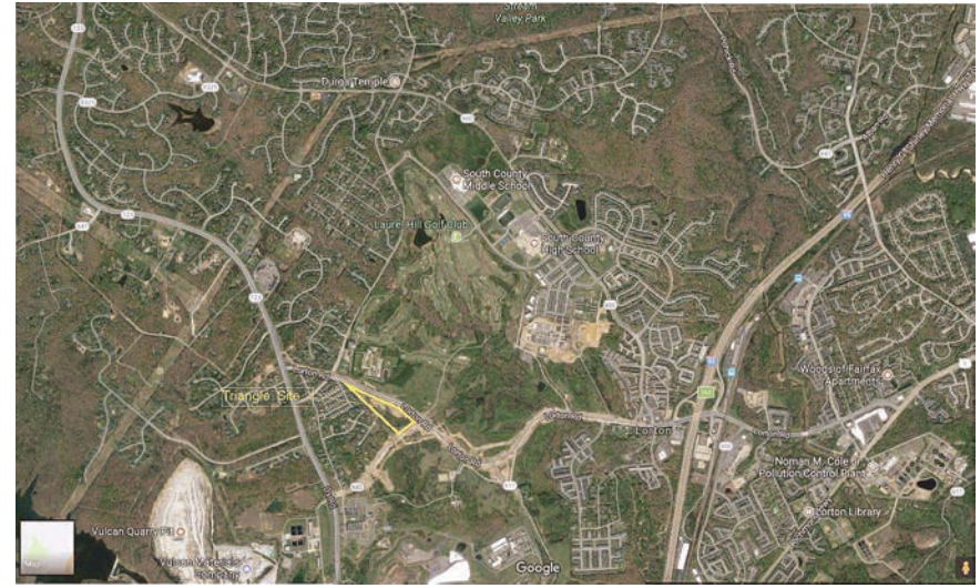
This aerial map shows the location for the proposed facilities.

The new facility includes an approximately 34,000 square-foot police station and an approximately 23,000 square-foot animal