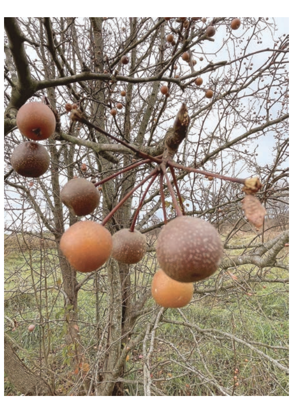
Callery pear and it's cultivar, Bradford Pear, escape area yards and grow in dense groupings in nearby forests, crowding out native trees

nature by the Governor Northam. If enacted by the Governor the work study recommendations will be due in November 2021 for potential action by the 2022 General Assembly.