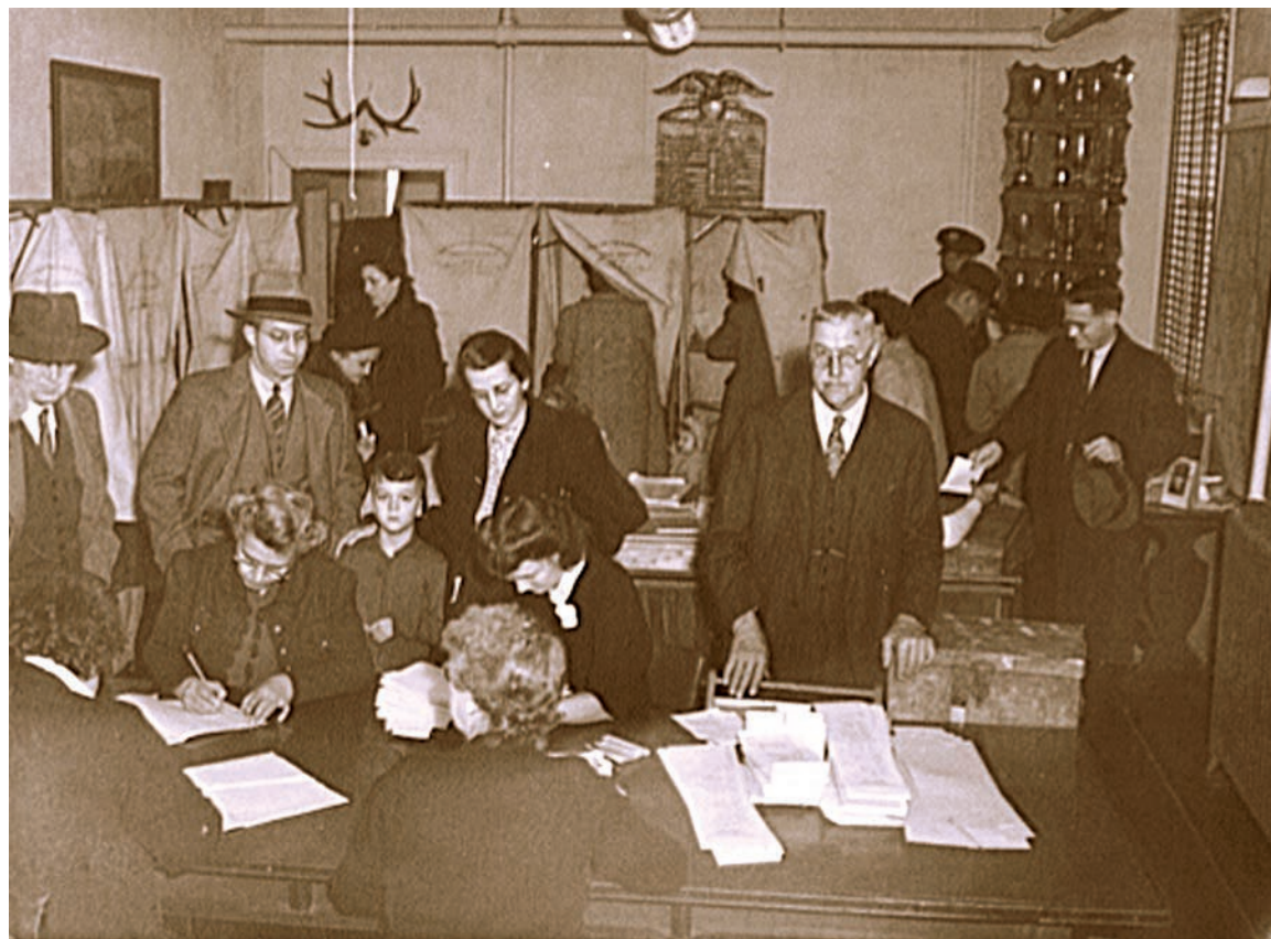
Election officials check poll tax records at an Arlington precinct in 1944.