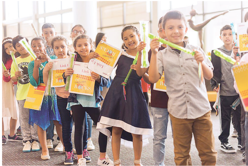
Students in Fairfax Symphony Orchestra “Link Up” 2019 music program.

Developed by the Weill Music Institute at Carnegie Hall, FSO’s “Link Up” program provides a unique opportunity for students