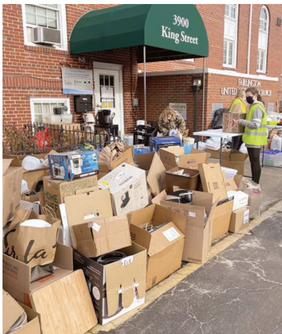
A volunteer looks over boxes of donated goods during the Alive! housewares donation day Feb. 6 at Fairlington United Methodist Church.