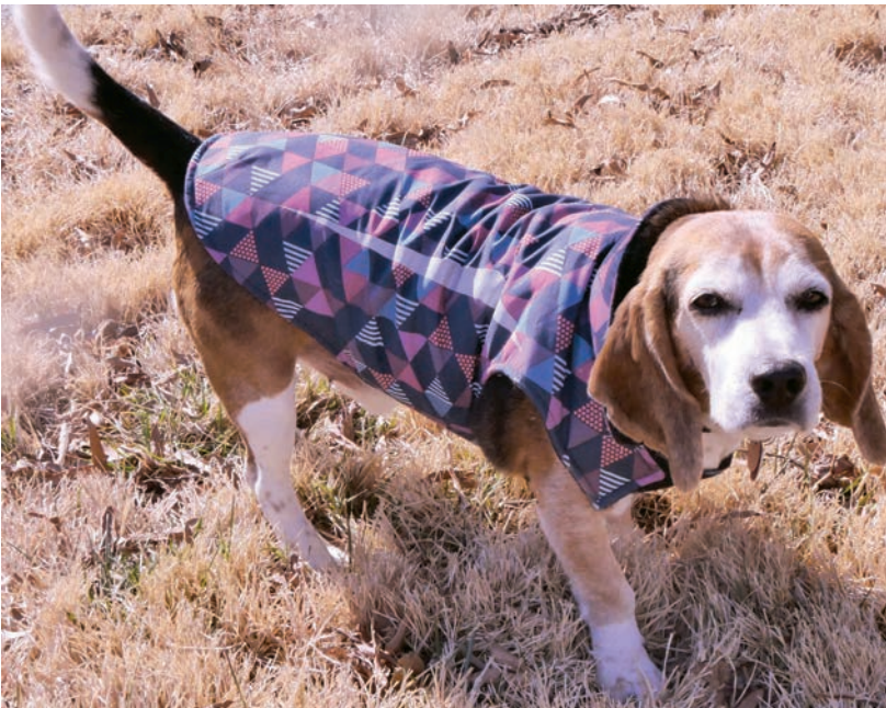
Buddy takes an afternoon stroll decked out in his new insulated jacket. As a new rescue dog of indeterminate age, Buddy is happy with his coat and everything else.