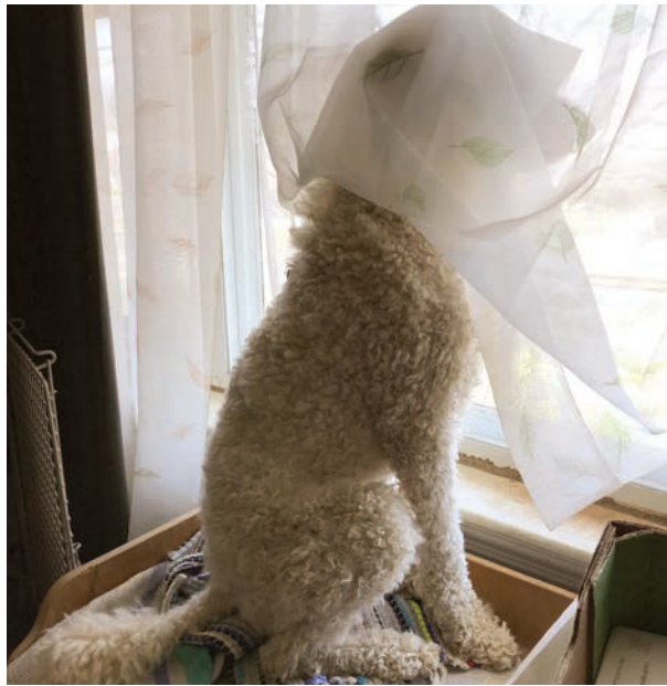
Dudley Do-Right, a four-year-old standard poodle, lets nothing get in his way when he is sitting by the front window keeping an eye on the neighborhood. Either that or "he is trying an outfit for Project Runway."