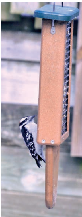
A male Downy woodpecker loads up on his favorite suet to provide much needed energy that burns off quickly in the cold.

But while they closed for in store customer purchases, the store kept an online presence and offered delivery as well as curbside pick up. Zuiker says the regular customers kept coming and in the summer new customers started coming.