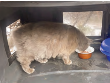
Mosby eats a meal under a shelter provided by volunteers in Arlandria.

To Cain, the trappers are her heroes. "It takes nerves of steel or a very calm nature to be a trapper," she said. "It can also take a lot of time and effort due to special traps, conditions -- no food the day before so they are hungry, decent weather if possible, special smelly food, etc. -- and availability of caretakers to help. Usually, they need to spend the night in someone's