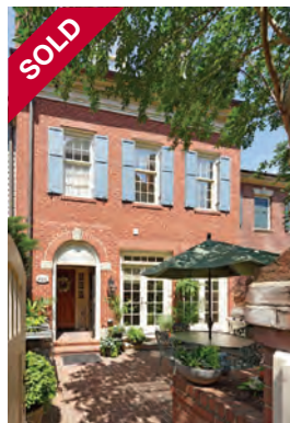
466 S. Union Street