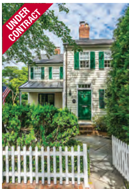
639 S. Saint Asaph Street