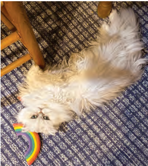
Apollo, White Surocat.