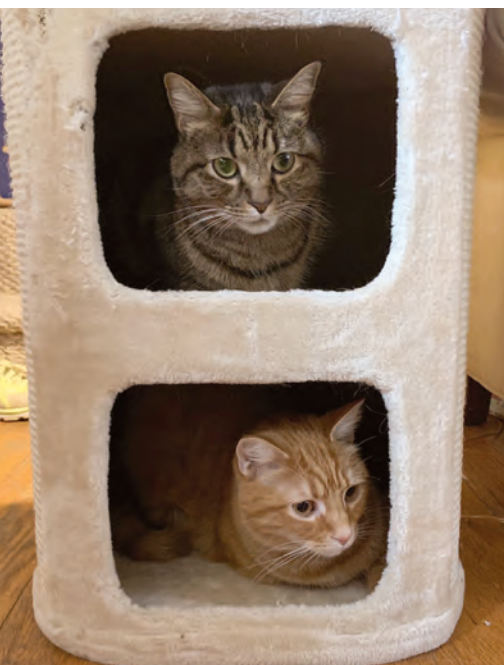
Pliny and Humboldt perch in their cat condo in Alexandria while keeping a close eye on the Roomba making its way across the room. (No exceptions to building height limits were required for this condo.)