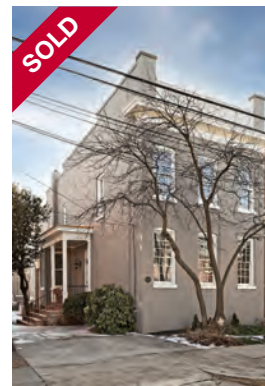
Represented the Buyer