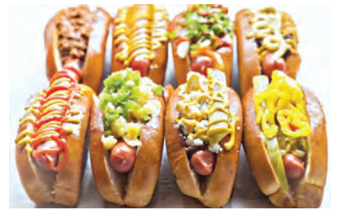
From a classic "House" dog to a banh mi-inspired concoction, a buffalo dog, a "Three-Piece Suit" and more, Haute Dogs and Fries runs the gamut.

Let's get one thing out of the way up front: There are many, many more Black-owned restaurants, cafes and eateries in and around Alexandria than this humble column can contain. So consider this an appetizer - or perhaps a buffet - of options to support those Black-owned businesses that feed the community (and caffeinate us, too).