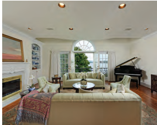
18 Wolfe Street