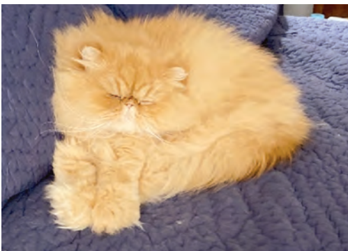
Percival, Orange Surocat.