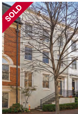
404 Oronoco Street