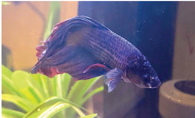
Steve the Surofish.