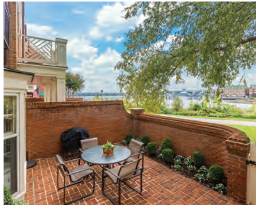
11 Wilkes Street