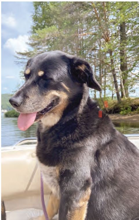
Mosby, the Surodog, is a 10-year-old female lab mix.