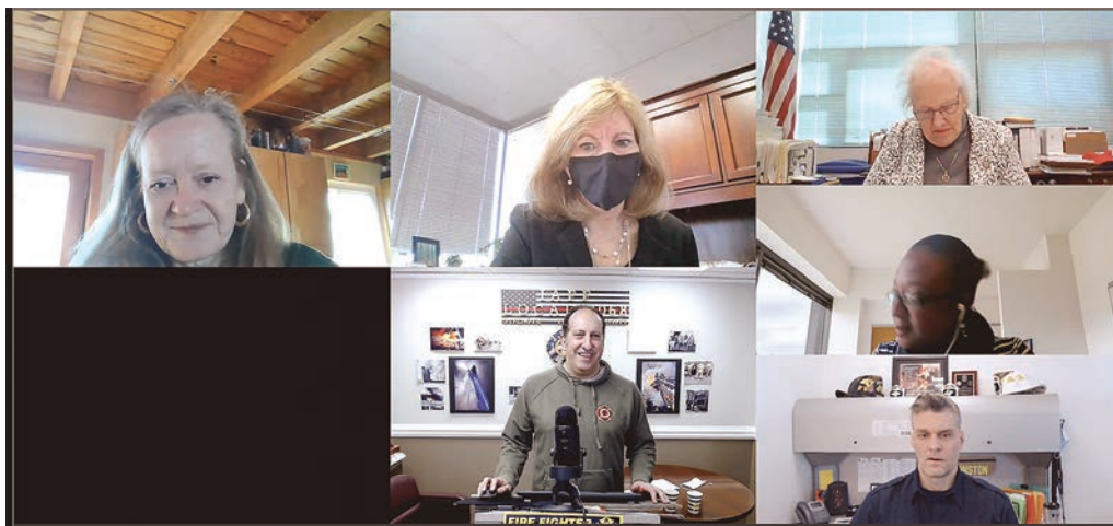
The Fairfax County Collective Bargaining Workgroup Session #2 in action.

move forward in this process that we're developing together," she said. Each group kept comments to three to five minutes.