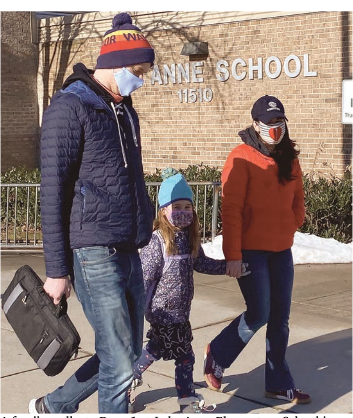
A family walks to Door 1 at Lake Anne Elementary School in Reston on the first day of face-to-face, teacher-led instruction in the school building for Group 5A Kindergarten, Pre-K, and Special Education students.

You Can Use in a digital format. It is available in Spanish and English and can be converted through a universal service in other languages. Lake Anne Elementary School serves a diverse population speaking 30 languages.