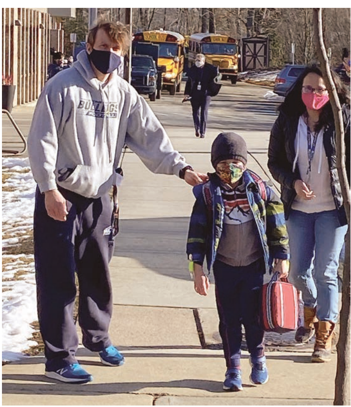
A family arrives at Lake Anne Elementary School in Reston on the first day of face-to-face, teacher-led instruction in the school building for Group 5A, Kindergarten, Pre-K, and Special Education students.