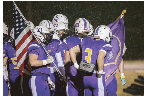
The Lake Braddock Bruins take the field before their game with the Westfield Bulldogs