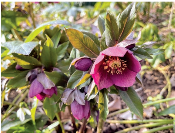
Deer don't decimate the Hellebores.