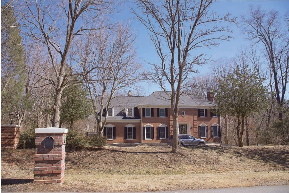
1 10705 Stapleford Hall Drive — $1,700,000