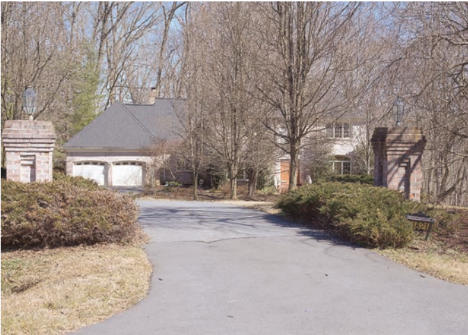
6 11621 Swains Lock Terrace — $1,325,000