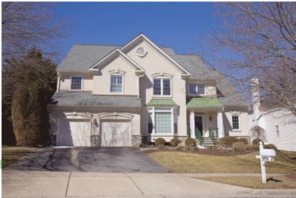
8 10912 Lamplighter Lane — $1,250,000