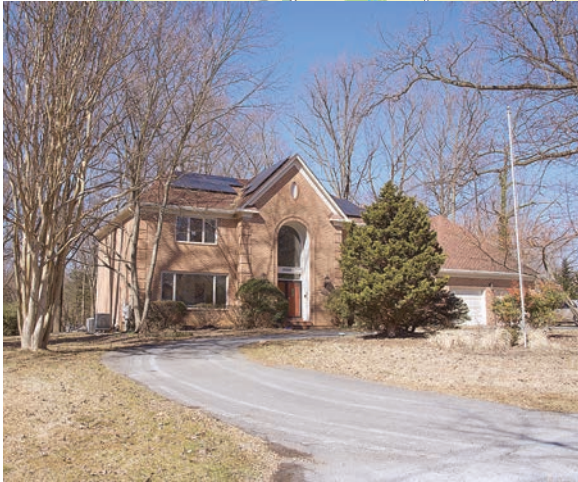
5 10300 Gary Road — $1,325,000