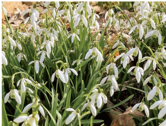
These snow drops did first emerge when there was still some snow on the ground.