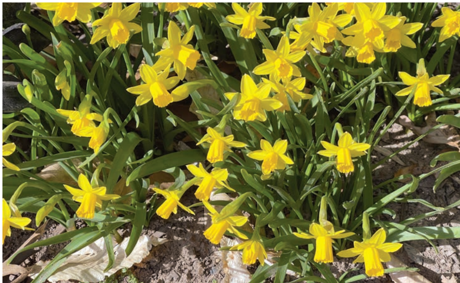
Daffodils seen this week in Potomac.