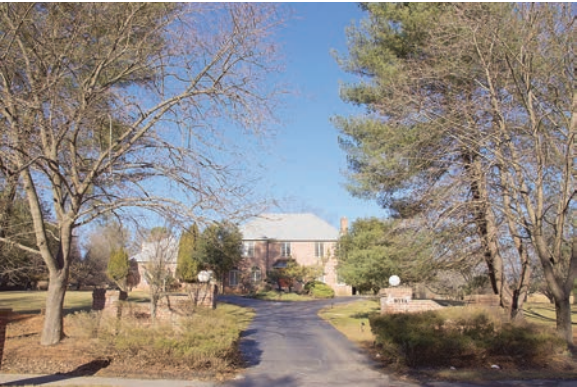
7 8711 Brickyard Road — $1,250,000

Address.....BR FB HB Postal City.....Sold Price... Type.....Lot AC. Postal Code ... Subdivision..... Date Sold