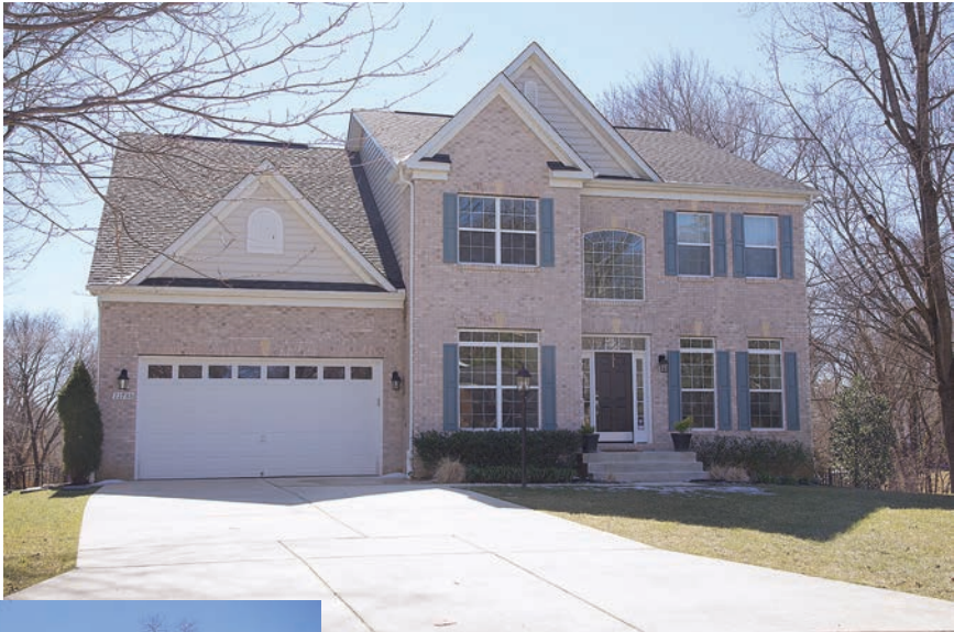
3 11735 Devilwood Drive — $1,512,000