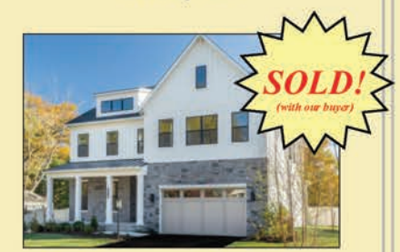
7029 Santa Maria Ct McLean, 22101 $1,572,763