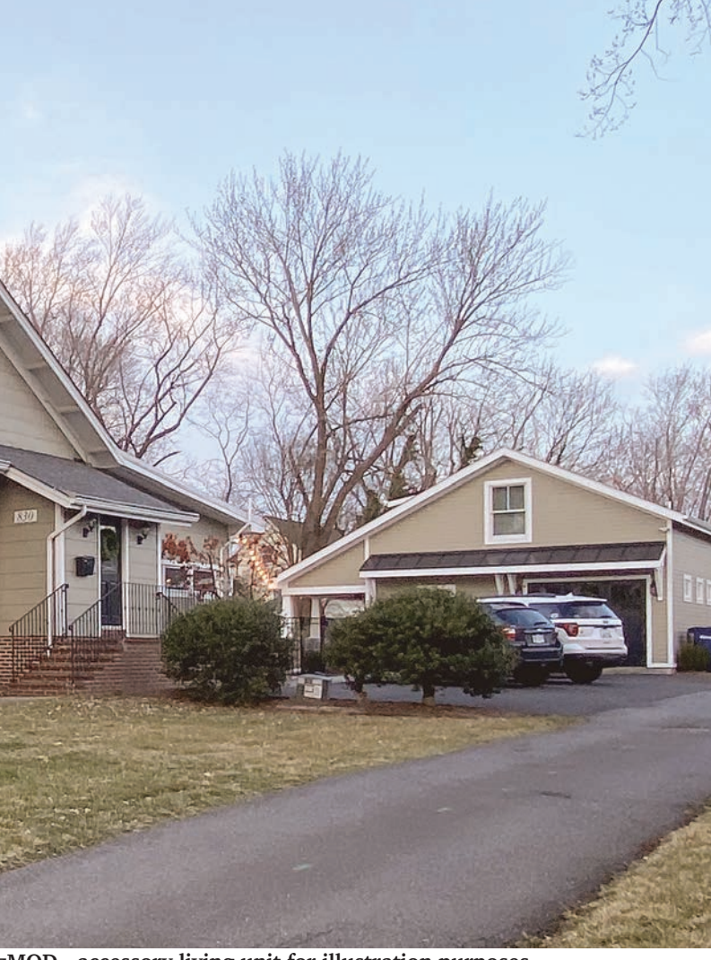
zMOD - accessory living unit for illustration purposes

The Board approved the motion to lease County-owned property to Sigora Solar, LLC 6 VIENNA/OAKTON / McLean Connection March 17-23, 2021