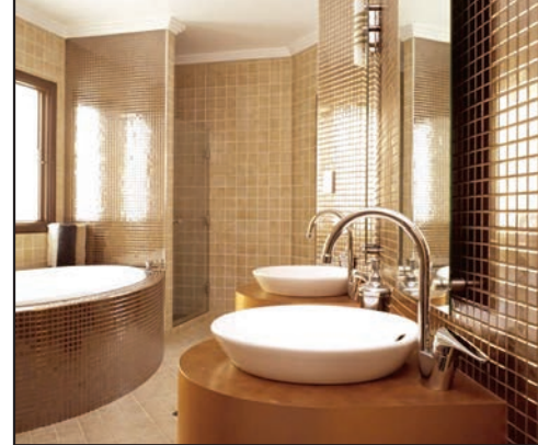
Fully Insured & Class A Licensed Since 1999