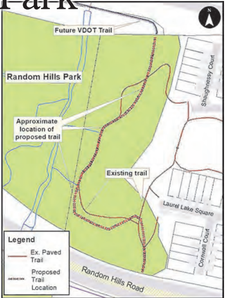
Some 1,000 feet of asphalt trail within Random Hills Park will be upgraded.

FCPA welcomes residents' suggestions and concerns about this project before the design