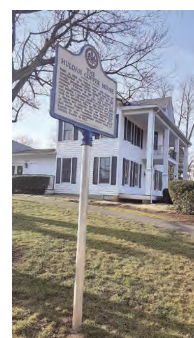
The Coffer house is now being used by Burke Centre for community activities.

In the early 1990s, when Roots was still alive, she gathered information and approached Fair-