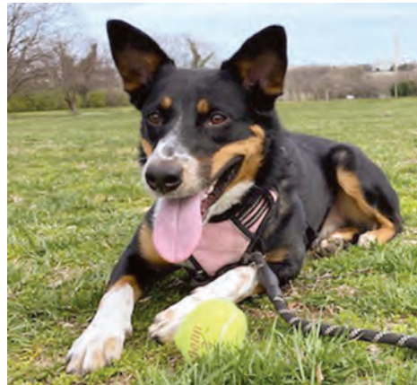
Meet Lady Grantham (of Arlington)

They have some similar interests, sharing a love of swimming and long hikes, followed by equally long naps. And Lady delights in being able to find and return every tennis ball thrown. By all accounts, Lady is truly a