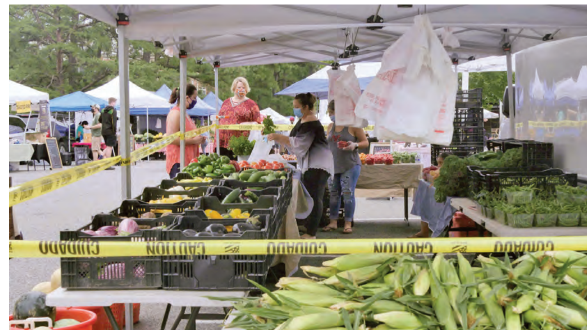
Lubber Run Farmer's Market does a brisk business in August but with a new “no touch” policy and social distancing.