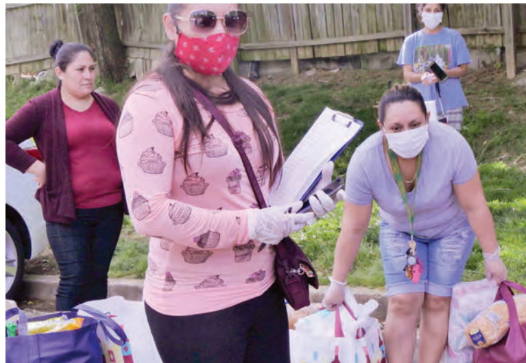
Parents with assistance of Kenmore PTA organize a monthly food distribution serving 75 families in April and expecting over 100 in May.