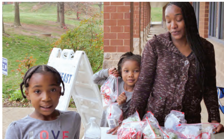
Children stop by Kenmore Elementary to pick up grab and go meals as feeding sites open outside schools to provide meals for school kids after schools close due to COVID.

Arlington County organized the Co-operative for Hunger Free Arlington (CHFA) to address the needs of everyone in Arlington. CHFA is a set of informal relationships between the county, APS, AFAC and groups such as PTAs, faith-based food pantries, restaurants offering food to the needy and an expanded Meals on Wheels. Diane Kresh, Co-chair, says, “By connecting the various players we can identify gaps to make sure we’re not overlooking a neighborhood.”