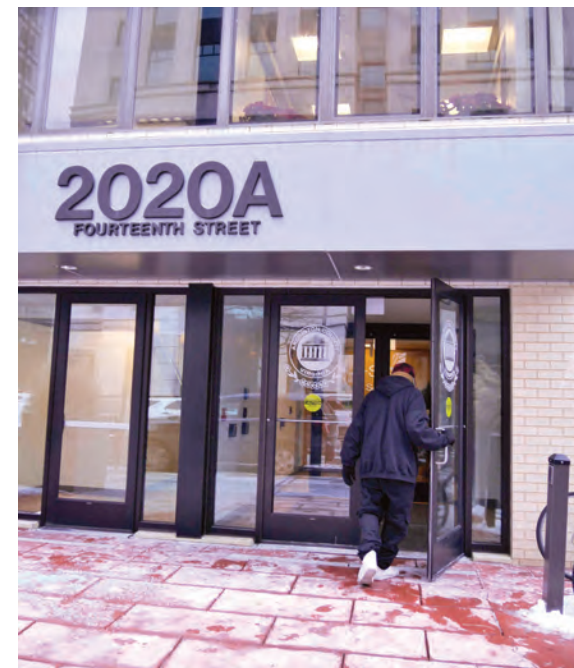
A-SPAN organizes a cereal drive for homeless at the Homeless Services Center.