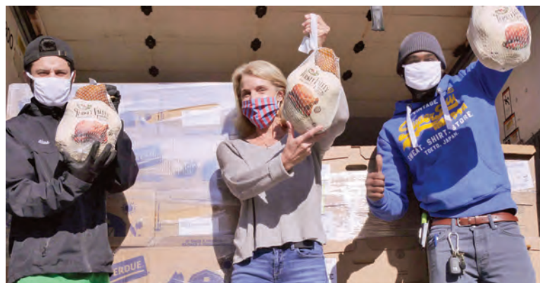
Arlington Food Assistance Center (AFAC) provides 2,500 turkeys to low-income families at Thanksgiving.