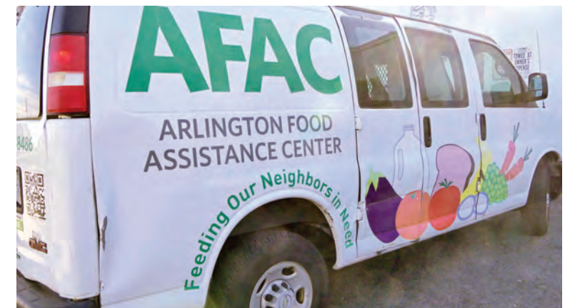
AFAC truck is a well-recognized symbol of the supplemental food assistance program serving over 2,800 as the needs grow during the pandemic.