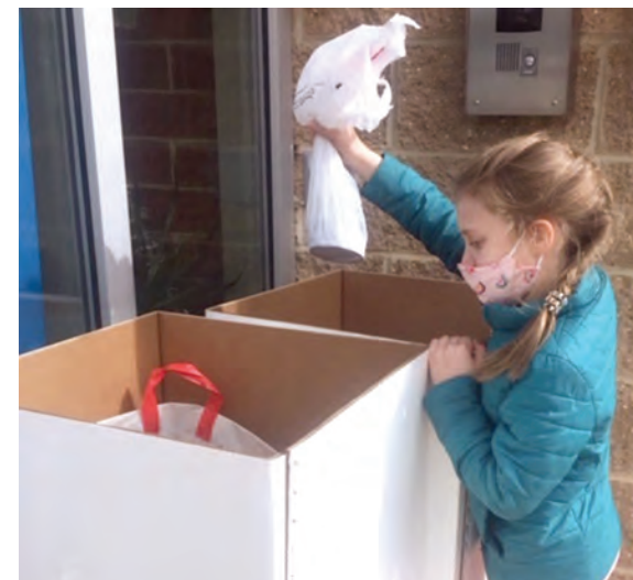
A second grader puts her sack of canned soup and tuna in the Arlington Food Assistance Center (AFAC) box at Langston Community Center on Saturday, February 27. AFAC partnered with Arlington Parks and Recreation to help feed neighbors in need by setting up donation boxes outside twelve community centers the weekend of February 27-28.