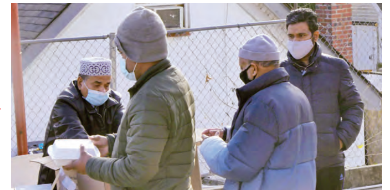
On Martin Luther King Day, volunteers serve chicken biryani and pass out relief packages to Muslim men filing out of the mosque at the Bangladesh Islamic Center on S. Nelson.