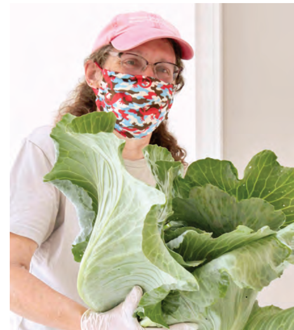
Community volunteers bags fresh produce for families in need. Donated produce from gardens all across the County was packaged and delivered totaling 6,825 pounds during the June 1-October 29 growing season.

Amazon partners with Freddie's Beach Bar & Restaurant to provide 10,000 meals in May to employees of Arlington Hospital Center, firemen and neighbors in low-income housing.