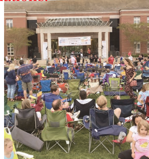
Friday Night Live! May 4, 2018, produced by the Herndon Chamber of Commerce (File photo)

"We cannot hold Friday Night Live! without the incredible support we have received