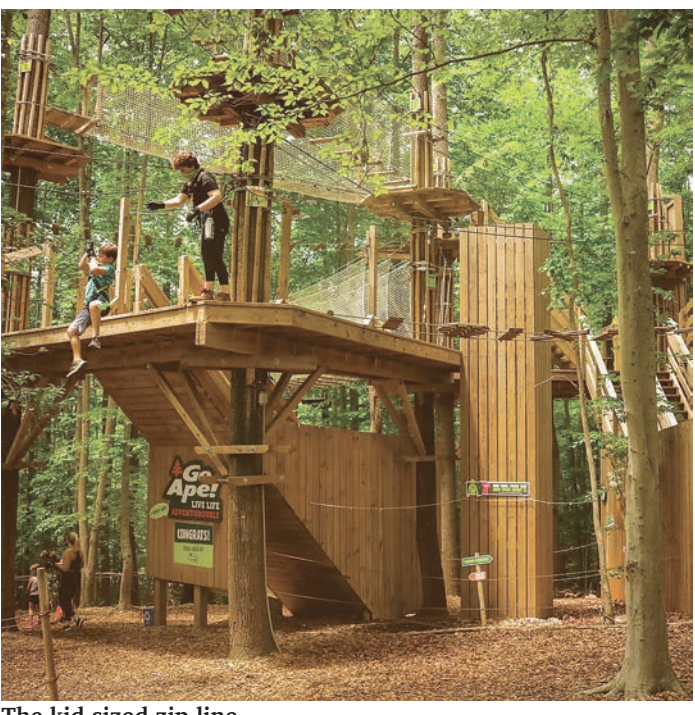
The kid sized zip line.