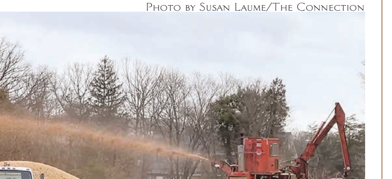
Contractors shred cleared trees into mulch as part of site development for new police station/animal