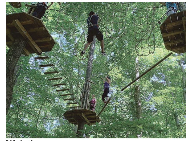
Life in the canopy.

There have been times when the harness is on,