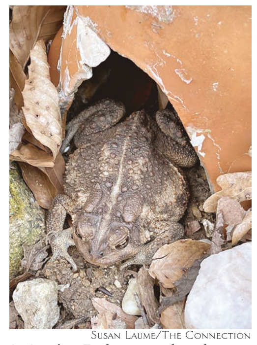
An American Toad, common throughout most of Virginia, hiding out during the day in debris, is active at night for breeding now, often into late summer.

Finally the large American Toad, complete with requisite toad warts, has a long trill which can last up to