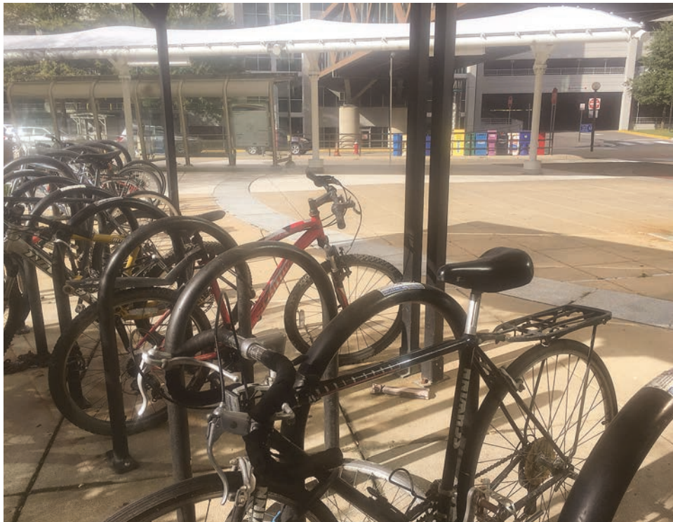
Bicycling picked up with the pandemic.