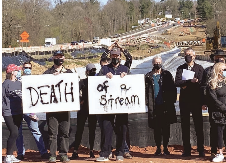
Vienna and Great Falls residents gather to mourn ‘Colvin Run’s death’ after the VDOT realigned the stream into a paved trapezoidal channel near the confluence with Difficult Run as part of its Route 7 Improvements.