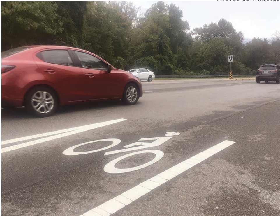
Commuting by bike is part of the picture.