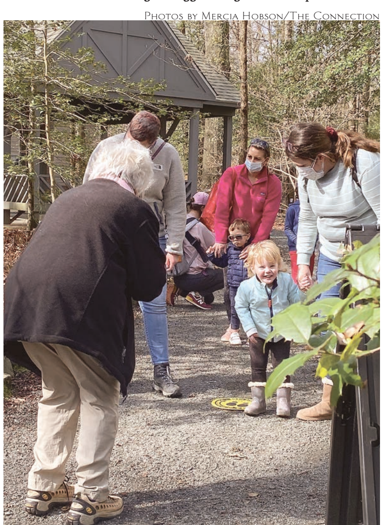
During Reston Association's inaugural Egg-stravaganza held April 1, 2021, children and parents are ready to hit the paths safely around Walker Nature Center and discover the many kinds of eggs different birds and creatures can lay.