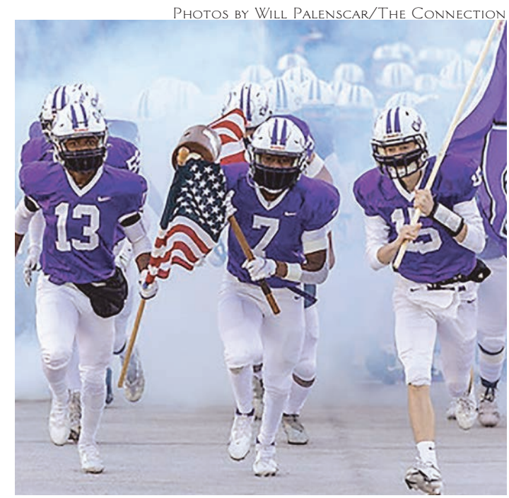
The Chantilly Chargers charge onto the field for their game with Westfield.