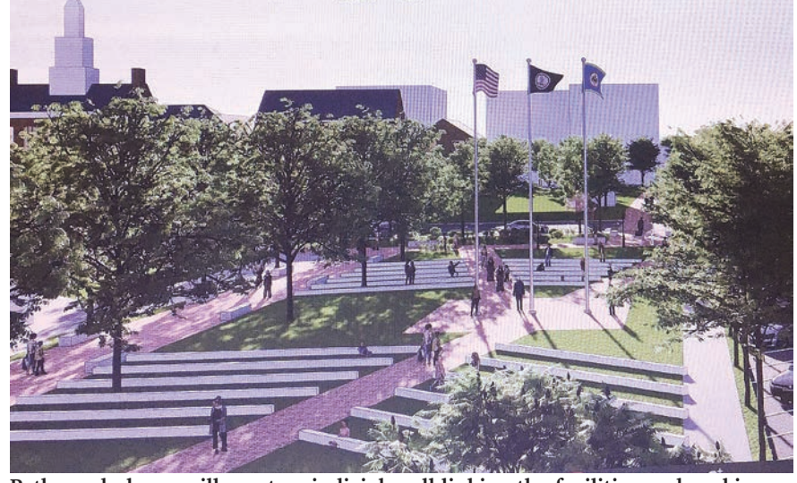
Paths and plazas will create a judicial mall linking the facilities and parking garages.

Burke / Fairfax / Fairfax Station/Clifton/Lorton / Springfield 🗞 April 8-14, 2021 🚸 5