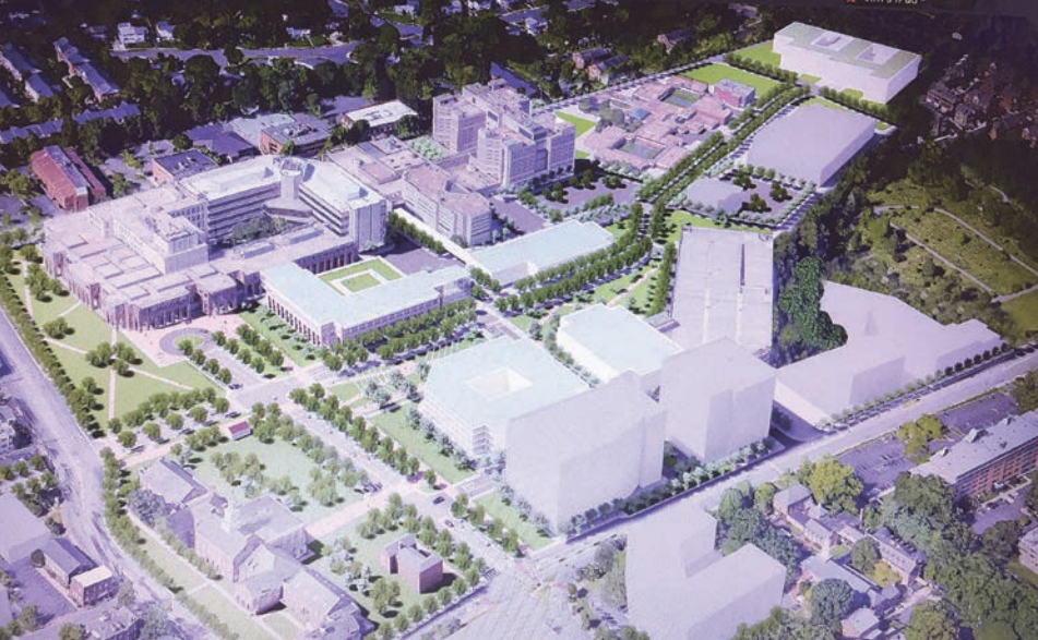
An aerial view of the Judicial Complex shows the new buildings (in gray) in foreground, at right.