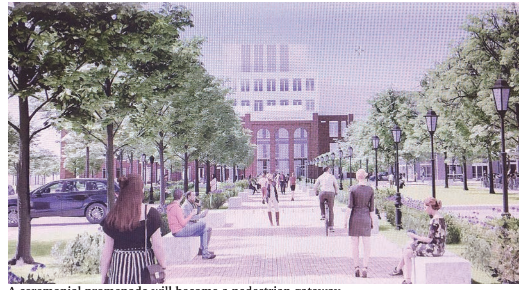
A ceremonial promenade will become a pedestrian gateway. www.ConnectionNewspapers.com