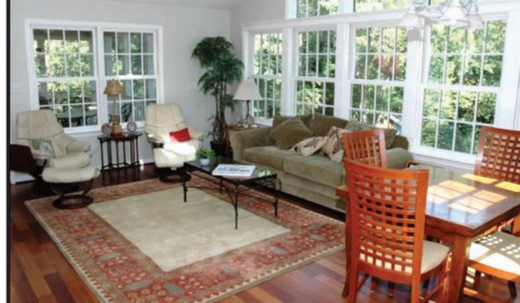
... Tech Painting's got you covered!