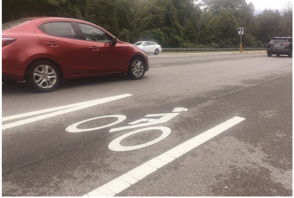
Commuting by bike is part of the picture.