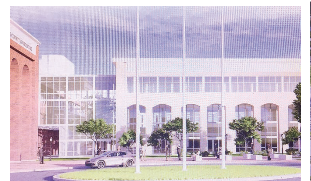
The new Building 1 (in white) will be adjacent to the existing courthouse.