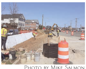
Looking north along Rolling Road, crews are busy relocating the curb to allow another lane to fit in this tight space in western Springfield.

The price tag on both projects together is $78.9 million, and this funding comes from federal, state, county and Northern Virginia Transportation Authority funds. Initially, officials looked at putting the utilities underground in this area, but "this is no longer being pursued due to cost," VDOT said.