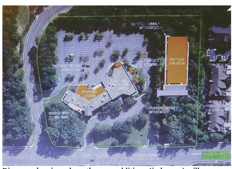
Diagram showing where the new additions (in brown) will go.

community. That way, the children could stay there longer than four hours."