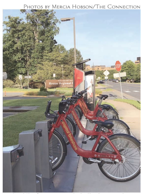
Grab a bike from any Capital Bikeshare station like this one at Library Street in Reston to explore areas along the Inaugural Tour de Hunter Mill routes. Then opt to sit back and take the bike on Metrorail and return it to any Bikeshare station.

The more interesting long route, according to Alcorn, is the Tour de Hunter Mill Long Ride Using the Metro. It is a 15-mile route. After the first portion, cy-