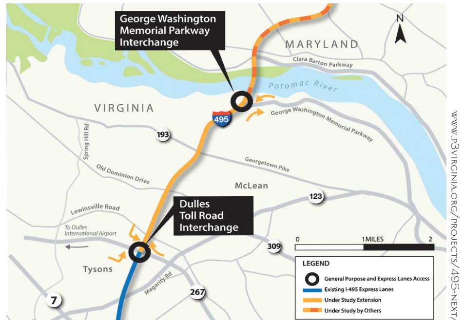
I-495 Express Lanes Northern Extension Project ("495 NEXT" or "Project") is a 2.5-mile extension of the 495 Express Lanes north from the current terminus near the 1-495 and Dulles Access Road interchange and to the vicinity of American Legion Bridge. Two new express lanes will run in each direction.