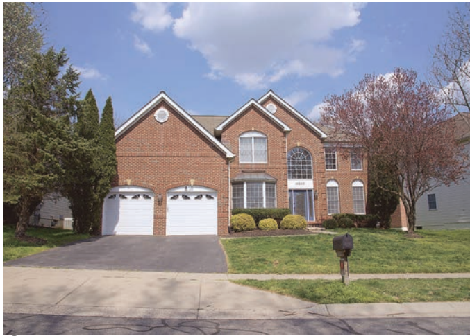
6 10507 Beechknoll Lane — $1,275,000