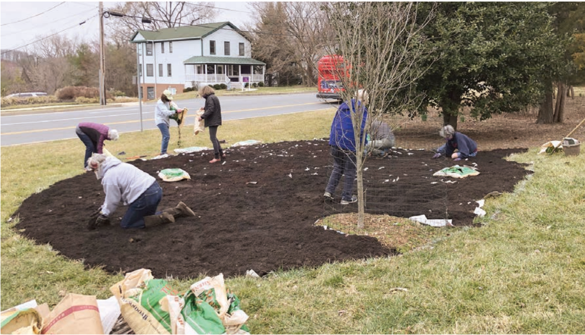
Members of the Potomac Village Garden Club hard at work on a garden of native plants at the Potomac Library.