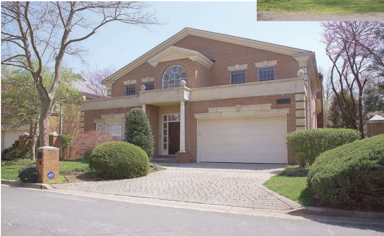
1 10016 Chartwell Manor Court — $1,350,000