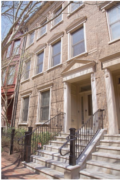
5 12442 Ansin Circle Drive — $1,280,000