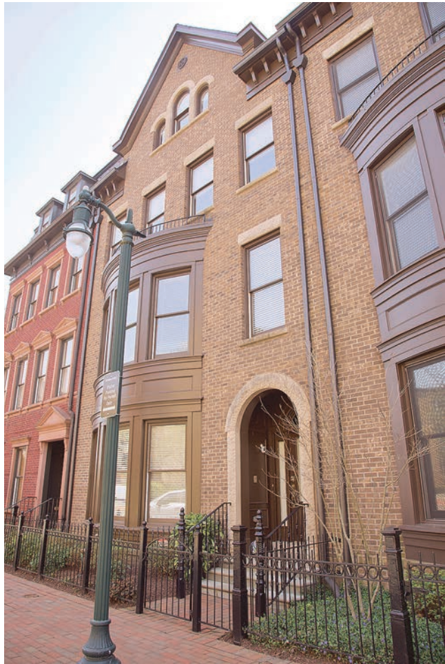
3 7802 Pearson Knoll Place — $1,350,000