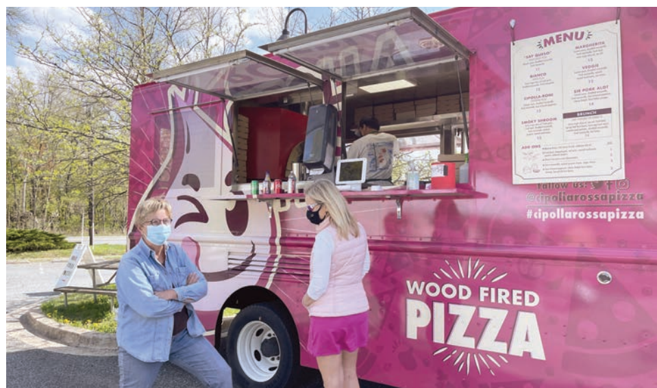
It only takes a few minutes for pizza to be ready, catch up with neighbors while pizza bakes in the wood-fired oven. Order at the market or online https://cipollarossa.square.site/