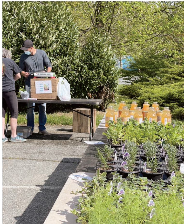
Simply Delicious, selling freshly baked breads, pies, cookies and more, under the cherry blossoms by Potomac United Methodist Church.