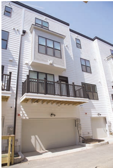
8 11322 Emerald Park Road #39 — $1,271,515