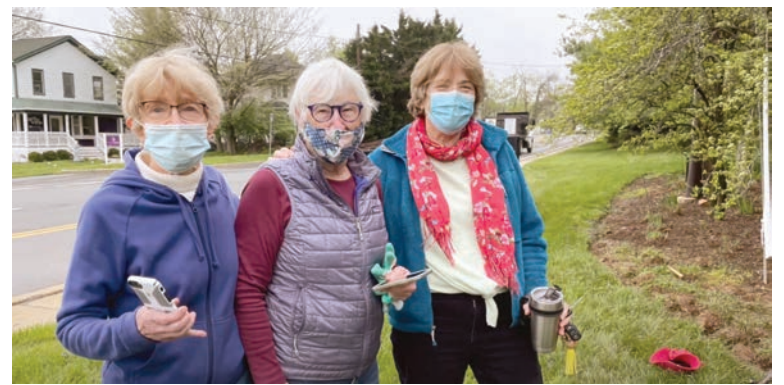
Members of the Potomac Village Garden Club

SCREENSHOT FROM HTTPS://YOUTU.BE/AOVXSEA2K6M