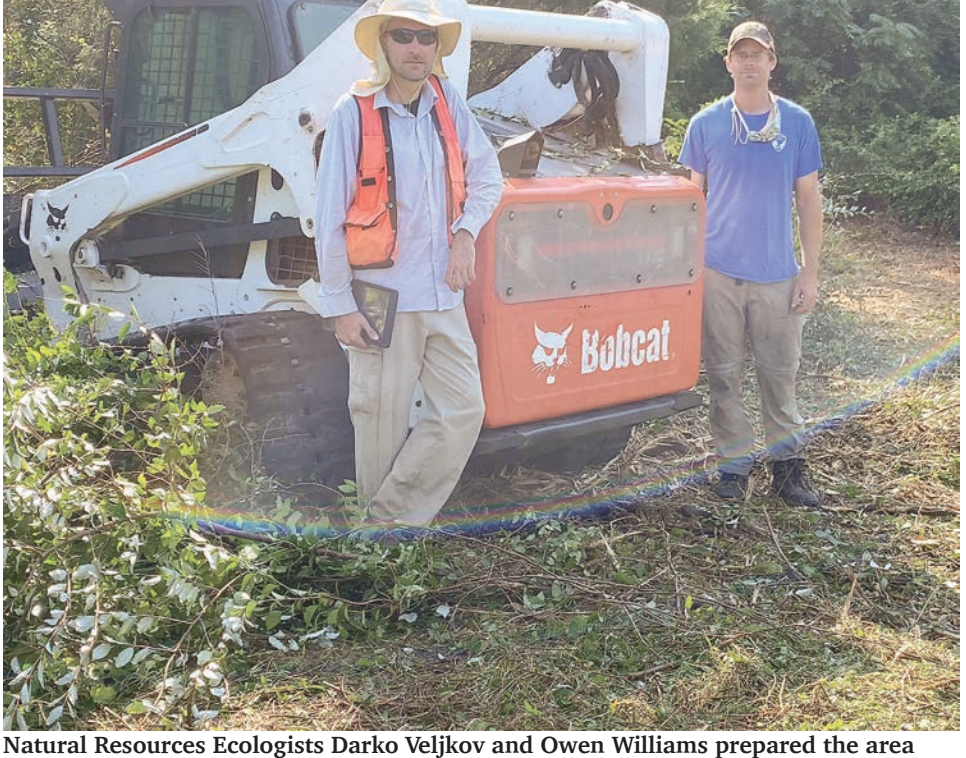
well in advance of the burn using mechanized equipment and hand tools

. A "wet line" was laid along the firebreak, and was reapplied periodically. Drip torches were used to begin combustion in the lower portion of the field working back toward the entrance, in a manner that worked with the light wind and forced the fire in on itself. This