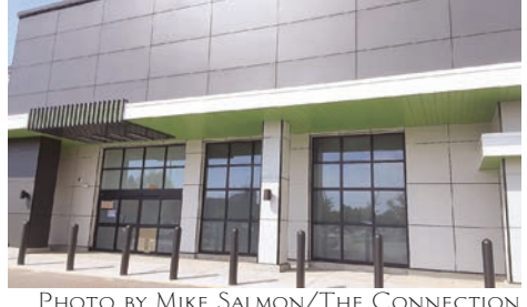
So far, the exterior remains nondescript, and Amazon probably likes it that way.

Open Air Spring Market. Noon to 5 p.m. At the www.ConnectionNewspapers.com