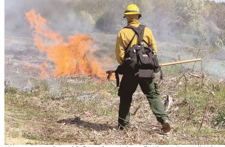
Fire crew member with fire rake monitors fire intensity on dead brush pile. ♦ April 22-28, 2021