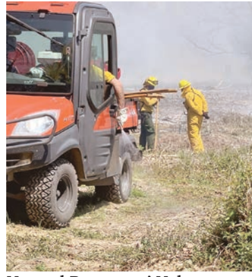
Natural Resources' Nelson Debarros, a botanist, lays a 'wet line" on the fire break for increased safety.

allowed the smoke to rise straight above the field and minimized smoke reaching trails and outlying areas.