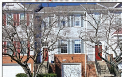
Clifton • $572,000