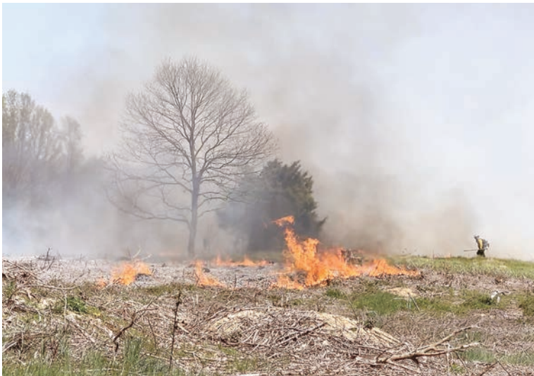
Fire intensity was kept below what could affect live standing trees.

Additional burns may be needed on the same site until hearty invasive plants weaken and don’t regrow in following seasons. Williams predicts any future burns there, if needed, will have lower intensity and less smoke, but with all the same safety protocols in place to assure the continuing success of this important tool for natural resource management.