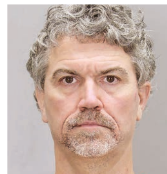
FCPD PUBLIC AFFAIRS BUREAU Drew John Steiner

Bureau at 703-246-7800, option 3. Tips can also be submitted anonymously through Crime Solvers by phone – 1-866-411-TIPS (866-411-8477), by text – Type "FCCS" plus tip to 847411, and by web – Click HERE. Download our Mobile tip411 App "Fairfax Co Crime Solvers". Anonymous tipsters are eligible for cash rewards of $100 to $1,000 dollars if their information leads to an arrest. If you wish for a detective to follow up with you, please leave your contact information.