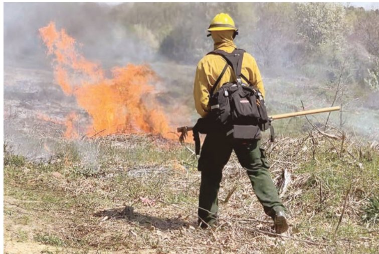
Fire crew member with fire rake monitors fire intensity on dead brush pile.