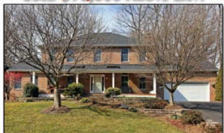
Clifton • $950,000