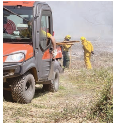
Natural Resources’ Nelson Debarros, a botanist, lays a “wet line” on the fire break for increased safety.

allowed the smoke to rise straight above the field and minimized smoke reaching trails and outlying areas.