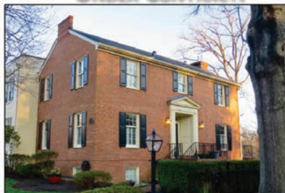
Springfield • Rhygate • $684,900