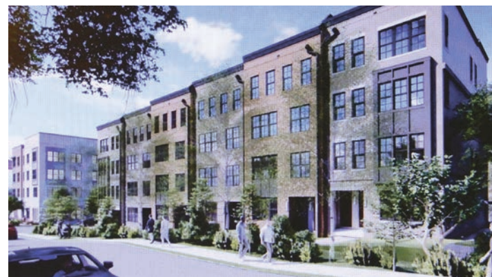
Artist's rendition of the two-over-two, stacked townhouses on Oak Street.

Chewle also noted that "A lack of internal, traffic circulation within the site could put more traffic onto Oak Street. The development is projected to yield 35 students, and