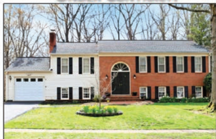
Springfield • Saratoga • $669,900