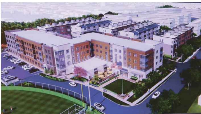
Artist's rendition of an aerial view of the entire project from the northwest.