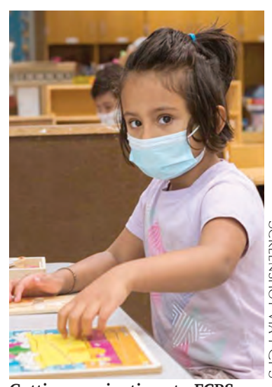
Getting vaccinations to FCPS employees who want them is critical to in-person learning.

ra. Given the eight votes of support to move forward with the consensus vote, the Board went ahead. Reading out the votes by name,