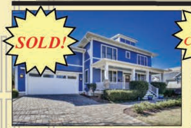
405 Park Avenue Falls Church City, 22046 Washington, DC 20001 $1,625,000