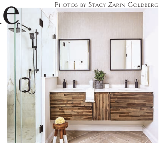
White countertop, dark wood cabinets, floating vanity, black fixtures create a spa-like atmosphere in this bathroom by InSite Builders & Remodeling.

When designers at InSite Builders & Remodeling transformed a cramped and outdated Jack and Jill bathroom in Bethesda into a master bath suite befitting a luxury spa, they had to expand the footprint of the bathroom by using square footage from an adjacent bedroom. The additional space was used to add a double sink, a new closet and a large zero-entry glass shower.