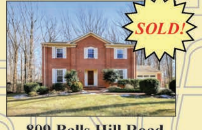
809 Balls Hill Road McLean, 22101 $1,399,000

We're seeing multiple contracts with escalations! Call to chat with JD today!