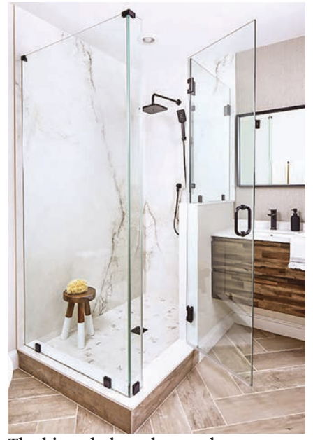
The hinged glass shower door are consistent with the contemporary design of this bathroom by InSite Builders & Remodeling.