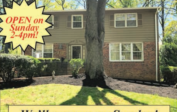
We'll see you on Sunday!