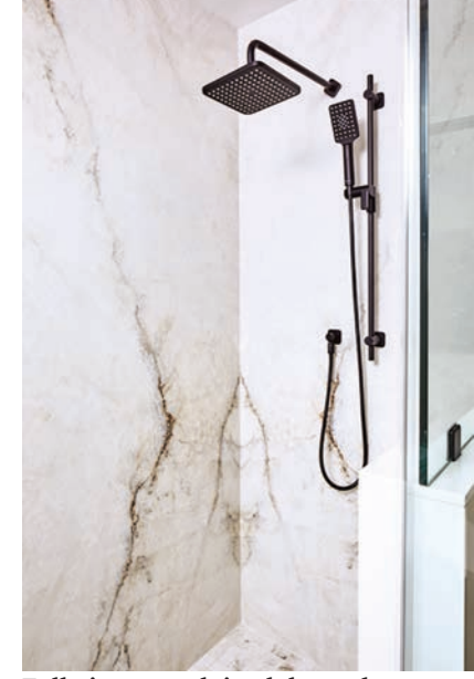
Full-size porcelain slabs make the shower a major focal point in this bathroom by InSite Builders & Remodeling.

Helping to create a sense of tranquility, the design team used materials such as a white countertop, dark wood cabinets, a floating vanity, black fixtures, and a hinged glass shower door. "The shower is a major focal point," said Stephen Gordon, InSite Builders & Remodeling. "It [has] full-size porcelain slabs which eliminate grout lines."