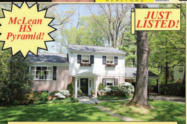
Offered for ... $925,000