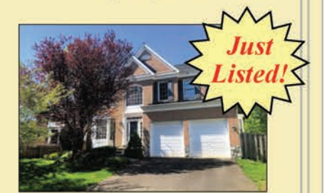
2226 Great Falls Street Falls Church, 22046 $1,297,000