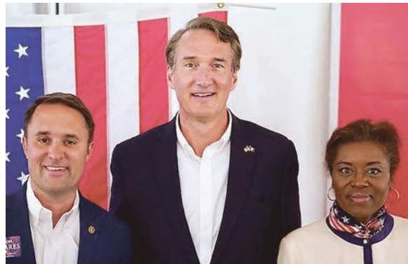
REPUBLICAN PARTY OF VIRGINIA The Republican stateside ticket, from left: Jason Miyares for attorney general, Glenn Youngkin for governor and Winsome Sears for lieutenant governor.