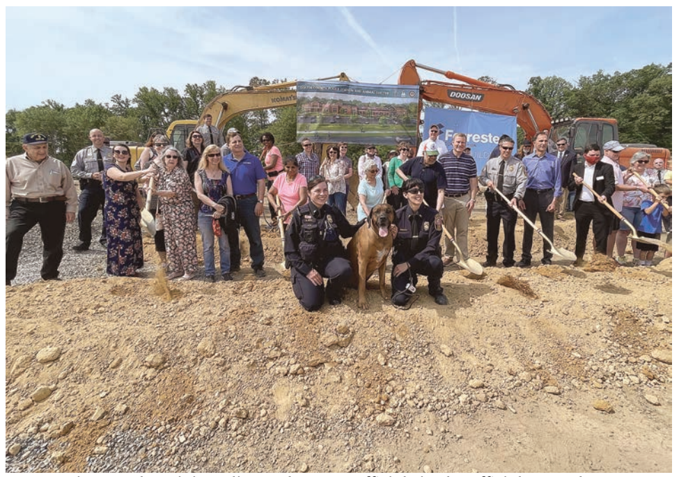
Community members join police and county officials in the official ground-breaking in Lorton.