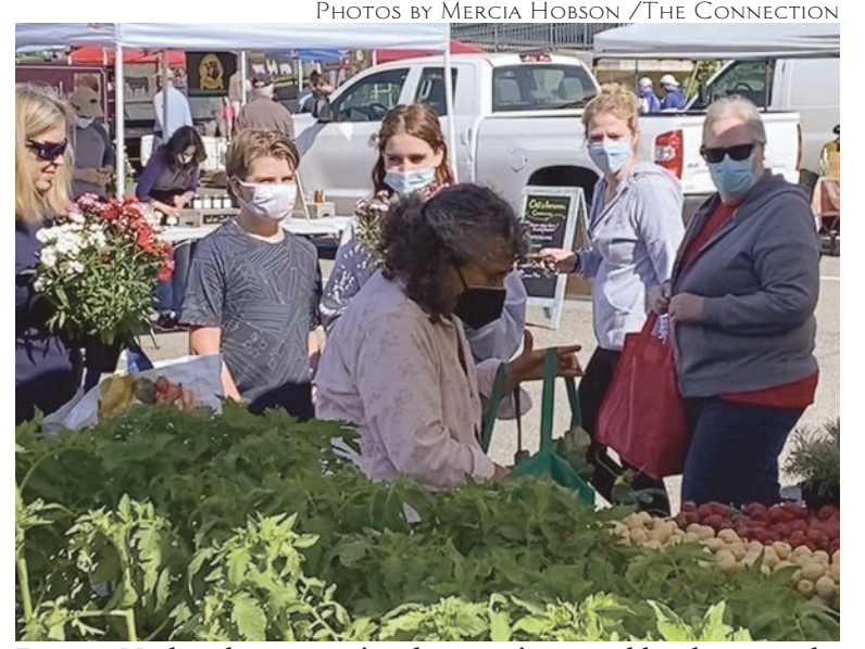
Farmers Market shoppers enjoy the experience and local, seasonal produce, meats, fish, and dairy at the Burke Farmers Market on May 15.

Pasta uses only local or organic flour mills, "amazing" veggies, and pasture-raised eggs. Rock Hill