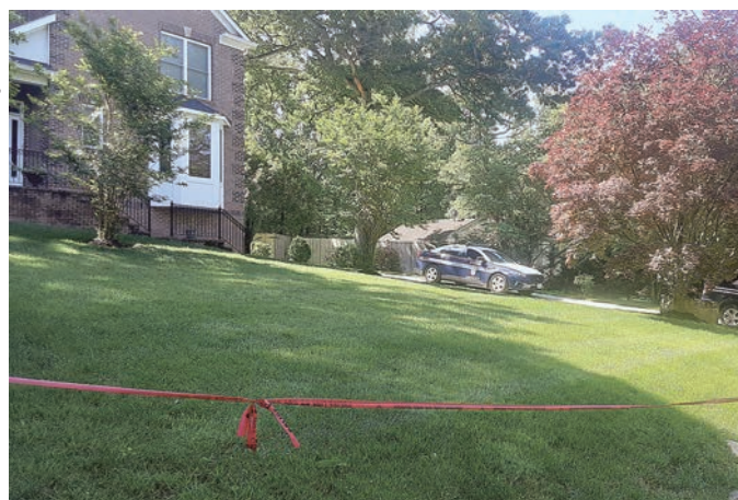
On Thursday following the shooting, police were still at the home in the southern Springfield area.

Victim specialists from Major Crimes Bureau's Victim Services Division have been assigned to ensure that the victim's family is receiving appropriate resources and assistance.