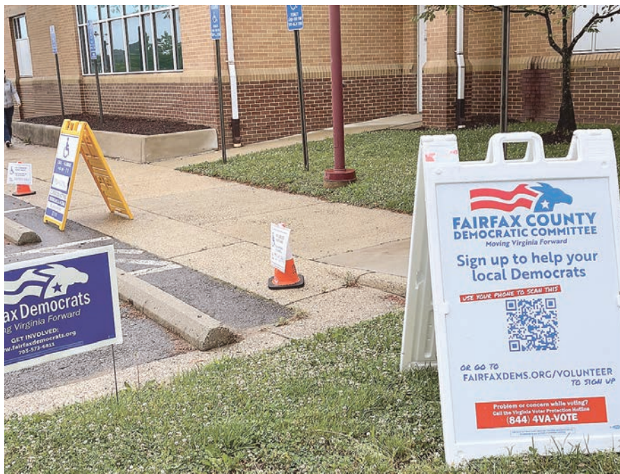
Only Democrat Party signage on display at voting centers for the single party Primary scheduled June 8.