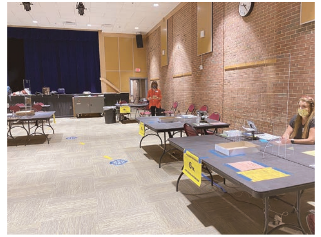
Precinct 214 Vienna No. 2 Vienna Community Center-The polling place is empty 3.5 hours into the County of Fairfax Democratic Party Primary Tuesday, June 8