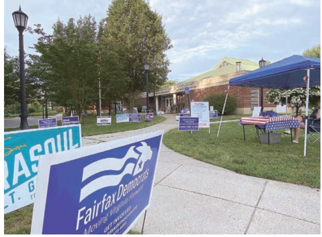
Precinct 328 Hickory at the Great Falls Library - No lines early Tuesday morning at the County of Fairfax Democratic Party Primary Tuesday, June 8 www.ConnectionNewspapers.com