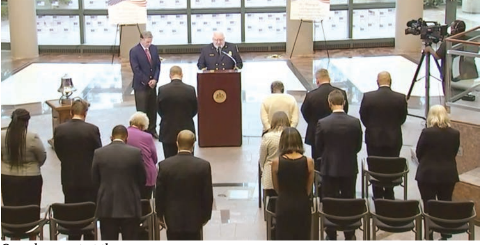
Crowd present at the ceremony.