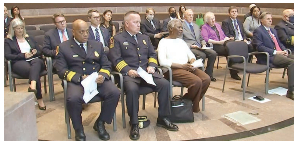
Leaders in the 13 jurisdictions of the Northern Virginia Regional Commission gather at the Remembrance Ceremony held June 9 for those lost to the COVID-19 pandemic.