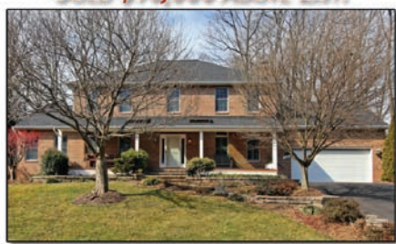
Clifton • $950,000