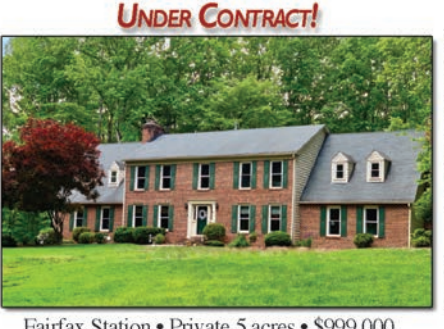
Fairfax Station • Private 5 acres • $999,000