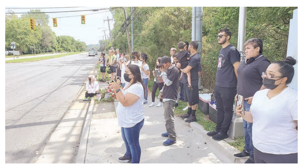
On Saturday, June 12, family gathered at the crash site.

a green traffic signal which resulted in the crash. The driver of the GMC Savanna remained at the scene.