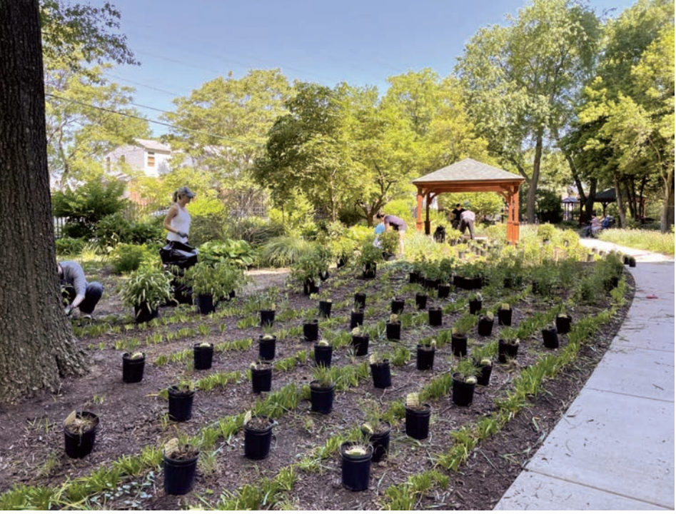
Volunteers from Sycamore School, McLean Bible Church and others help plant Virginia native plants for the new Culpepper Garden community garden on May 15.

Charles Culpepper owned the land where the current Culpepper Garden is located and was well known for his prolific displays of hybridized daffodils. When he sold his land,