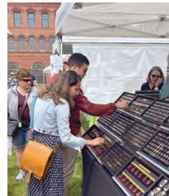
Shoppers browse the vendors at the Old Town Arts and Crafts Fair June 12 at Waterfront Park.