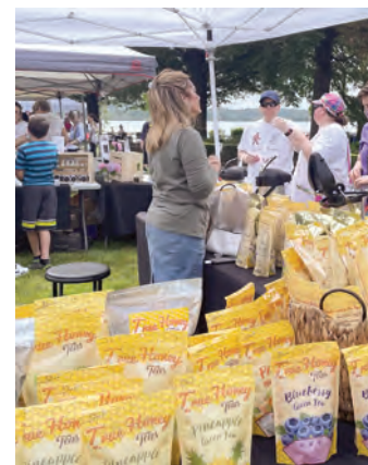
The Old Town Arts and Crafts Fair returned to Waterfront Park June 12.