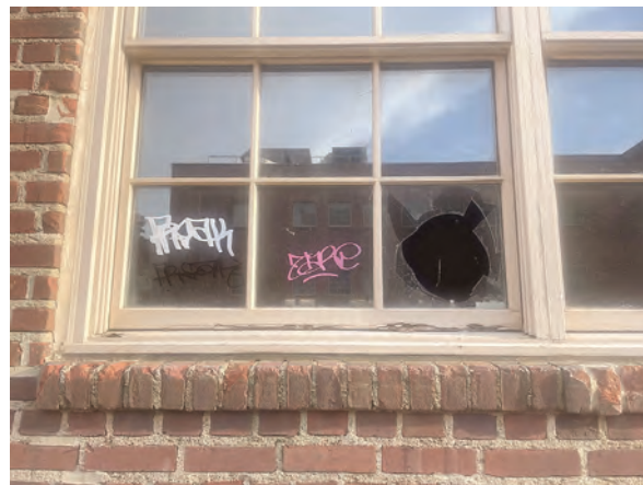
Broken windows and graffiti on a building at the corner of Prince and S. Washington streets.

The first phase of a planned 141-room hotel with ground floor restaurant and ballroom at the Northeast corner of Prince and S. Washington streets was approved in August of 2019. Nearly two years later the building remains boarded up and in disrepair.