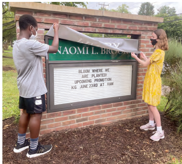
Students unveil the marquee officially renaming Matthew Maury Elementary School to Naomi L. Brooks Elementary School during a June 22 ceremony.