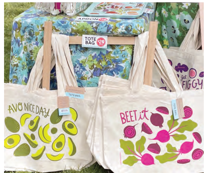
Handcrafted items were on display at the Volunteer Alexandria Old Town Arts and Crafts Fair June 12 in Waterfront Park.