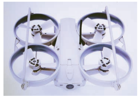
An example of a police drone.

175 mph. They each weigh 7,000 pounds and have a range of 400 miles. We often fly to Roanoke for routine maintenance and to Salem for major repairs. And the camera mounted on the front of the aircraft has video and night vision."