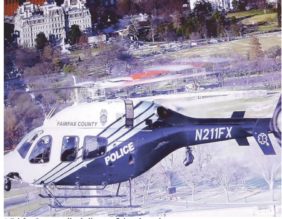
A Fairfax County police helicopter flying above the area.

MEDEVACS are our number-one priority; police missions are second. We'll leave police events to do Medevacs, and we'll leave events in other jurisdictions to do an event in Fairfax County. Our paramedics have even more training than Fairfax County Fire Department paramedics, so we can provide advanced,