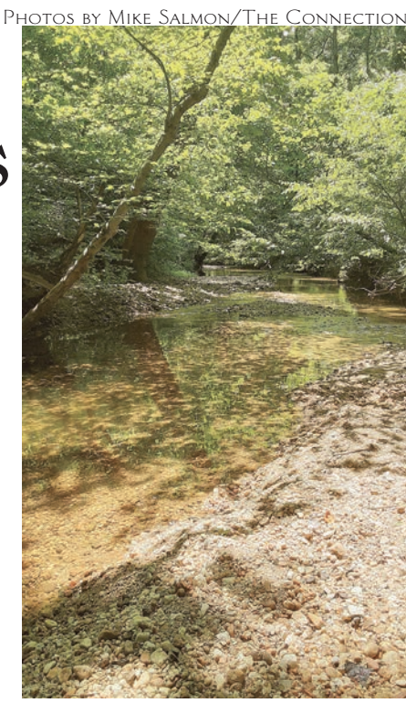
The meandering path of Long Branch is a green oasis in an area of the suburbs.

In February, a presentation was shown to the Friends of Accotink Creek on the Long Branch project, and after the presentation, a group walked along Long Branch to see what was happening. Long Branch empties into Accotink Creek near Wakefield Chapel and Braddock Road. The Friends of Accotink Creek were identified as a stakeholder group, along with Earth Sangha, Stone