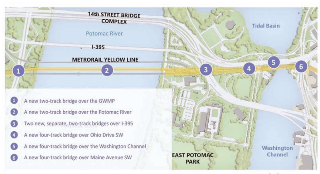
PROVIDED BY DRPT

The Franconia Bypass project, starting www.ConnectionNewspapers.com