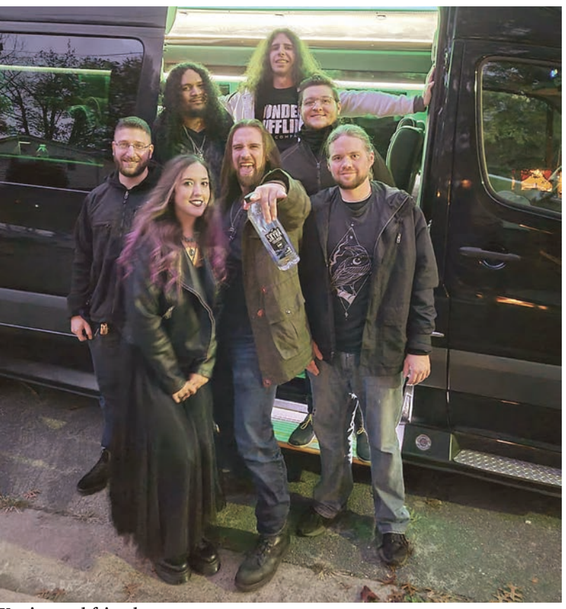
Konjur and friends

Konjur got its start over the last couple of years