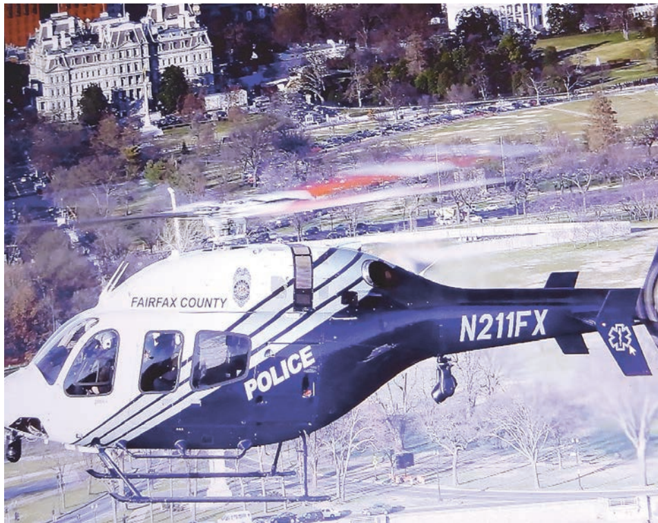
A Fairfax County police helicopter flying above the area.

MEDEVACS are our number-one priority; police missions are second. We'll leave police events to do Medevacs, and we'll leave events in other jurisdictions to do an event in Fairfax County. Our paramedics have even more training than Fairfax County Fire Department paramedics, so we can provide advanced,