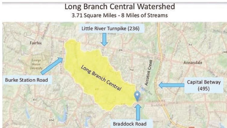
I-495, Braddock Road, Little River Turnpike and Burke Station Road are loosely the boundaries of the Long Branch watershed.

in others, causing trees to topple and the natural process is suffering. Officials are hoping to reduce the sediment eroding from the Long Branch Central Watershed by 2,433 tons per year and improve water quality and habitat. Officials are looking into methods for accomplishing this and are considering doing a lot of planting in different areas and working to reconnect the stream with its floodplain where that is appropriate and to stabilize and repair degraded outfalls where there is a lot of erosion. “One of the most critical aspects is that as we work to develop design solutions for given areas, we will share those proposed methods with the community for their feedback and input to make sure what we do meets the communities’ goals and needs,” said Charles Smith, chief of the Watershed