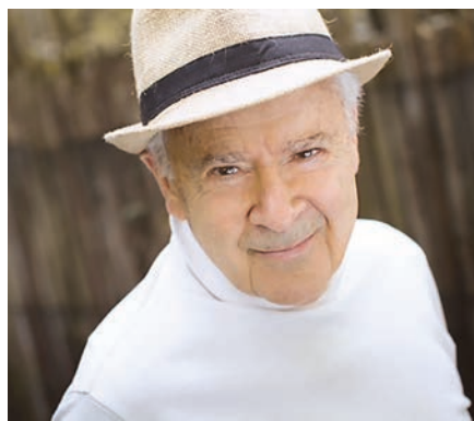
SMITH DAVIS PHOTOGRAPHY