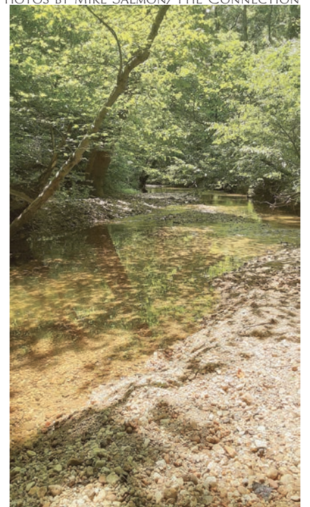
The meandering path of Long Branch is a green oasis in an area of the suburbs.

In February, a presentation was shown to the Friends of Accotink Creek on the Long Branch project, and after the presentation, a group walked along Long Branch to see what was happening. Long Branch empties into Accotink Creek near Wakefield Chapel and Braddock Road. The Friends of Accotink Creek were identified as a stakeholder group, along with Earth Sangha, Stone