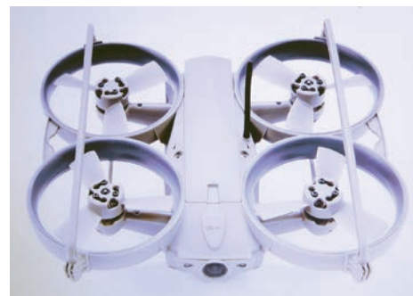
An example of a police drone.

175 mph. They each weigh 7,000 pounds and have a range of 400 miles. We often fly to Roanoke for routine maintenance and to Salem for major repairs. And the camera mounted on the front of the aircraft has video and night vision."