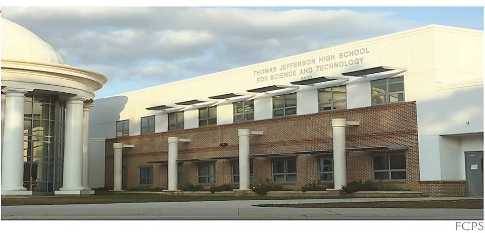
Thomas Jefferson High School for Science and Technology

According to Regulation 3355.14 from the Superintendent's Office on TJ Admissions, TJ is annually designated by the Virginia Department of Education as an academic-year regional governor's school for science and technology. It is under the sole direction and control of the Fairfax County School Board. Existing in the very diverse County of Fairfax, it serves select students who meet the eligibility requirements not only from Fairfax, including the City of Fairfax but four other Northern Virginia school divisions-Arlington County, Falls Church City, Loudoun County, and Prince William County. www.ConnectionNewspapers.com