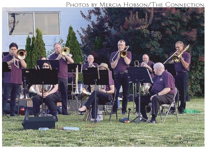
The "Cathedral Brass of Vienna Presbyterian Church" performs on the Arts Herndon Lawn Stage, part of the Arts Herndon's World Music Series.

"Reston Baby" (2021), published by duopress, is available for sale online and at the Reston Historic Trust & Museum for $10. Funds support future printings.