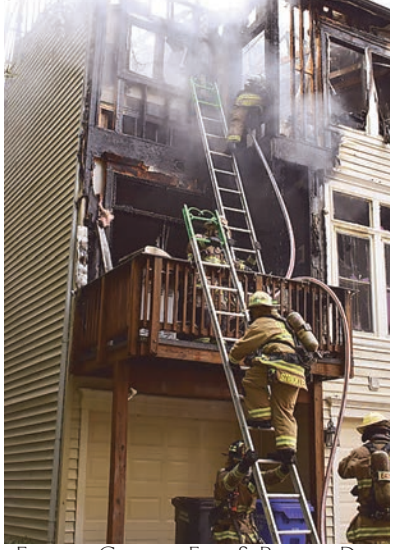
FAIRFAX COUNTY FIRE & RESCUE DEP Firefighters climbing up into the building

Crews quickly brought the fire under control. No civilians were injured, but one firefighter was transported to the hospital for evaluation of non-life-threatening injuries. None of the occupants were home at the time of the fire. It was reported by a neighbor who saw black smoke and flames coming from the house.