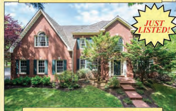
Offered for ... $1,549,999