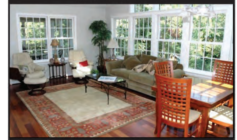
... Tech Painting's got you covered!