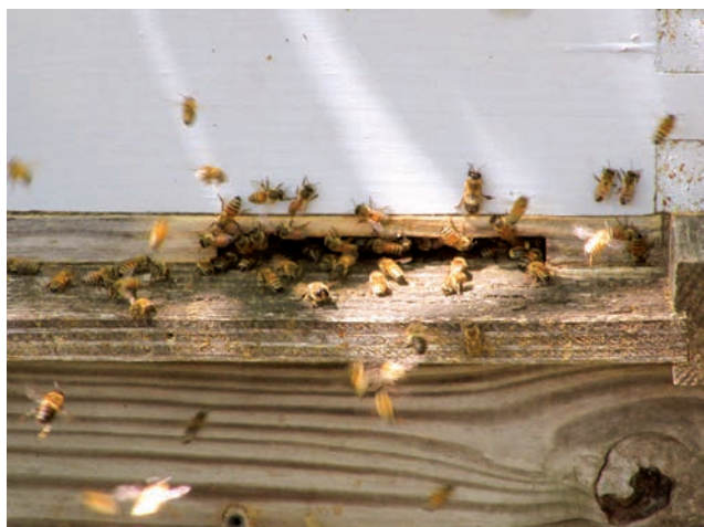
Bees entering a hive.