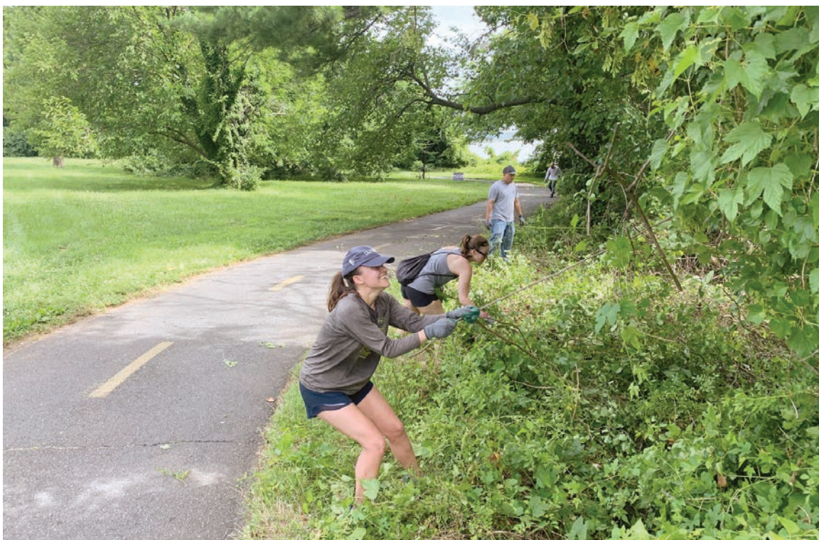
Volunteers fight the never-ending weed issue along the parkway.