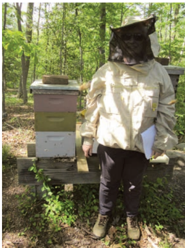
The author ... at Mount Vernon Estate with Ferree.