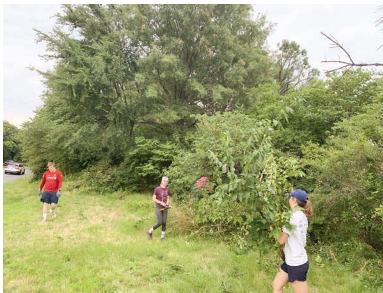
Kudzu is a known invasive species that causes problems in parkland.

There is an annual work plan WWW.CONNECTIONNEWSPAPERS.COM