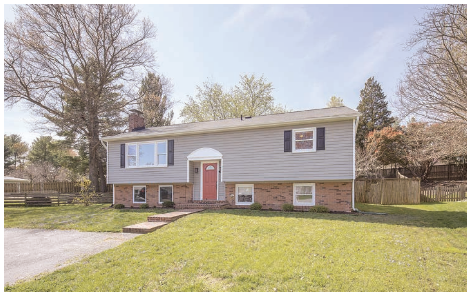
This house in Hayfield Farm was listed at $649,900 and after multiple bids, sold for $748,000.

It's that way across the board this summer in Northern Virginia and the signs keep going up in the front lawns, but they don't stay there long.