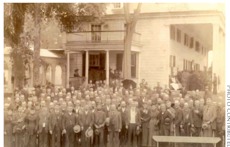
The Civil War veterans on the side of the Mount Vernon plantation.