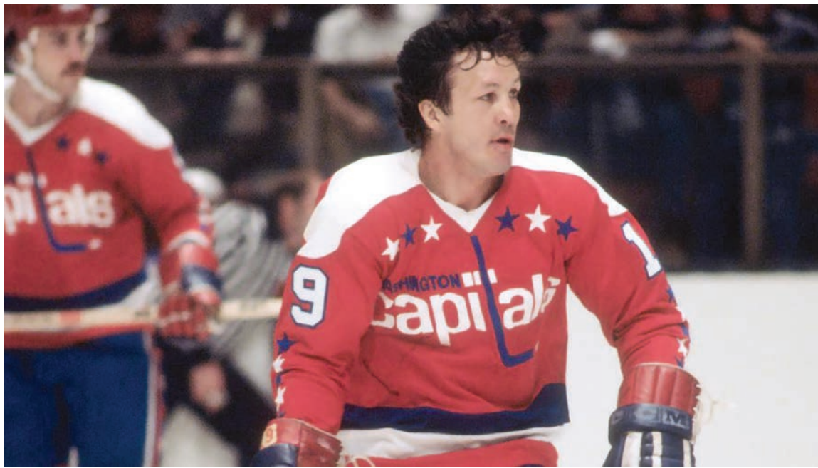
Bryan Watson played three seasons with the Washington Capitals. He died July 8 at the age of 78.