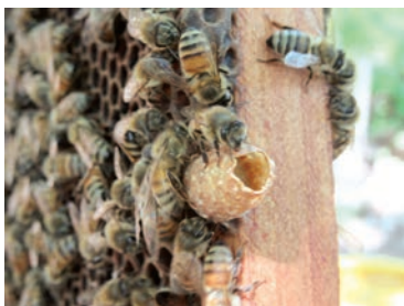
This is a queen cell that the bees made to raise a new queen.