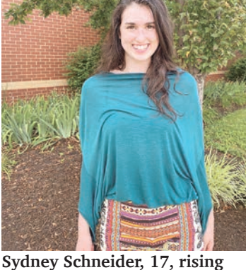
senior at Chantilly High School, dance captain.