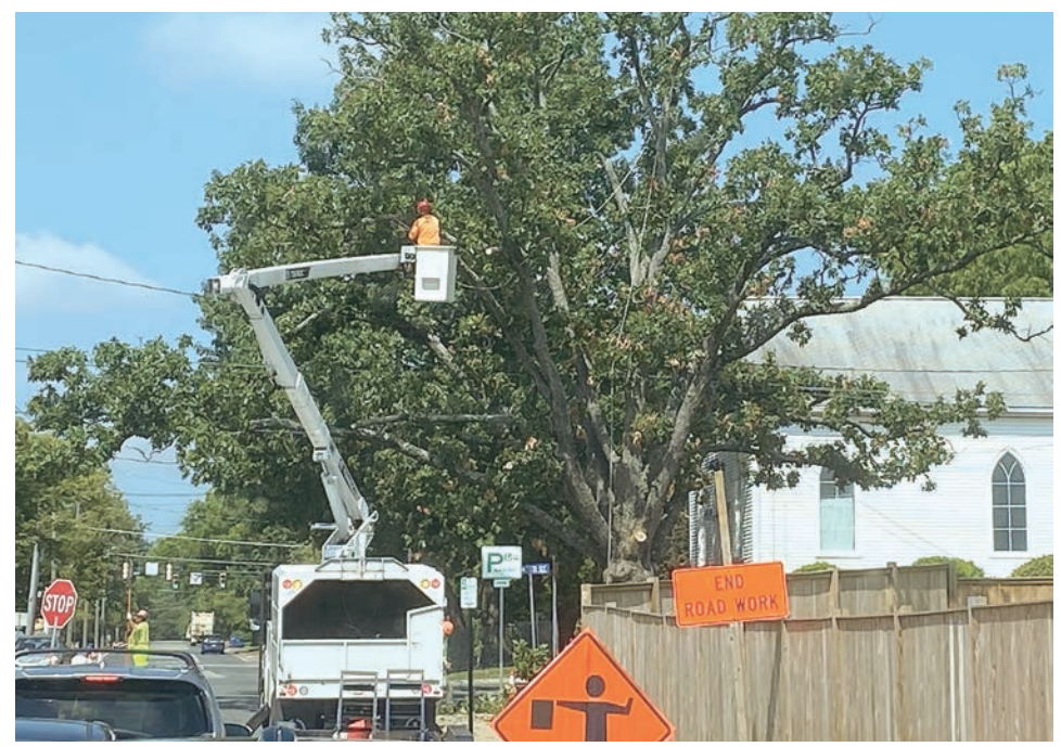
Professional arborists use a bucket truck to fell the nearly 200-year-old Overcup Oak tree. It is probably the oldest witness tree of its kind, telling the town's development from a handful of people in 1823 to a town poised for the Silver Line of the Washington Metro system.