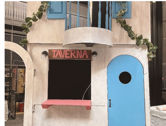
The set is being assembled and painted in the weeks before the show.