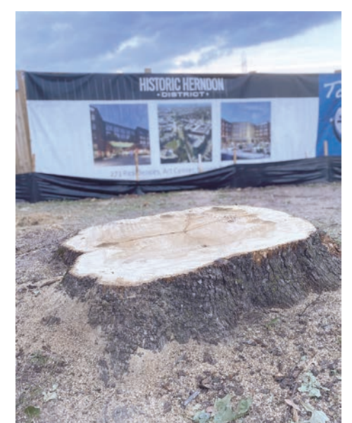
The tree removal as part of the Elden-Center Streets Intersection Improvements will assist with the current and future-use residential development on Center Street, which places greater traffic volumes in this project area according to the Town of Herndon.