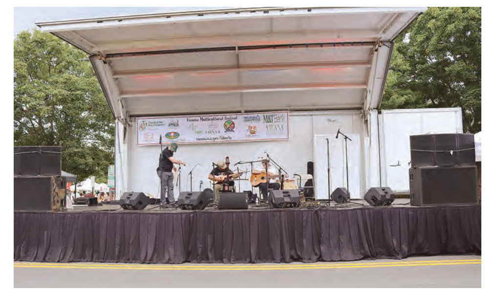
Performers of Rumisonko get ready to play Bolivian Folk Music.