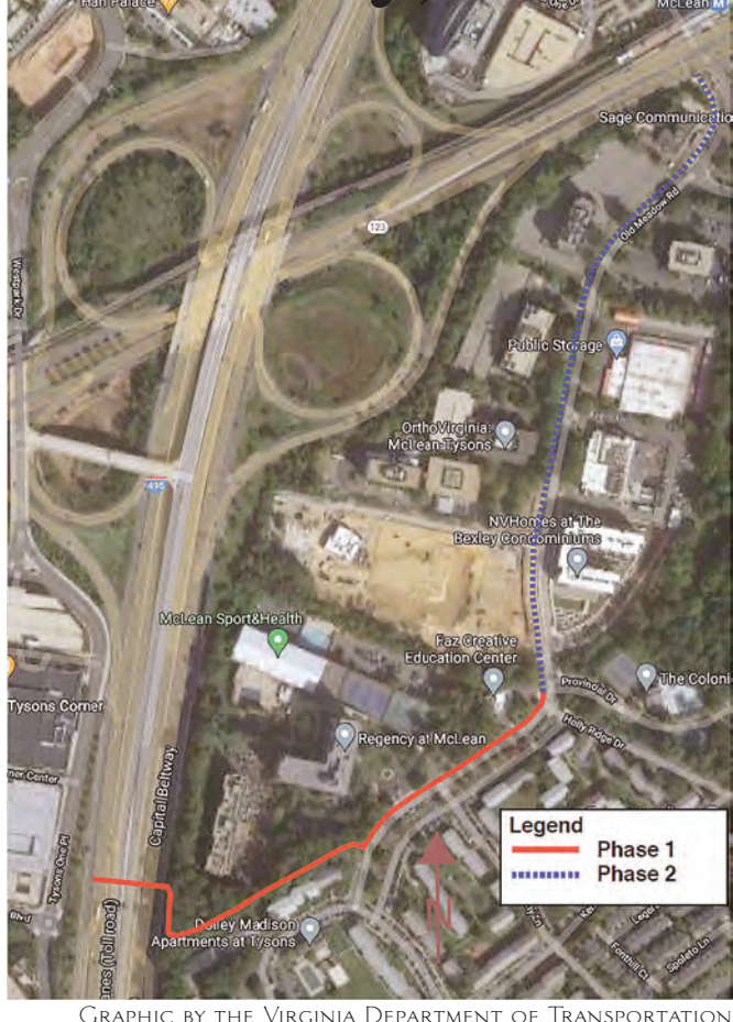
Access to Tysons is planned to improve for cyclists and pedestrians.

The pricetag for the whole project is $13.4 million and it is financed with federal, state and local funding. Phase I is scheduled to be completed in 2022, VDOT said, and the phase II work will be scheduled when funding becomes available.