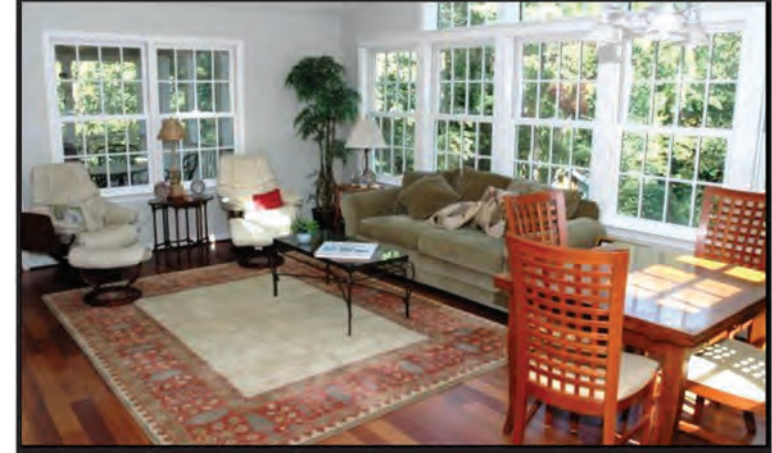
... Tech Painting's got you covered!