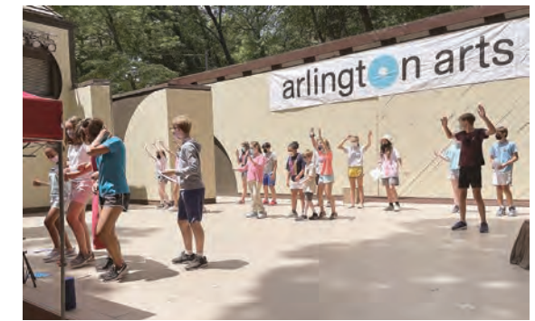
Safety measures, such as those put in place at Encore Stage & Studio in Arlington, are a response to rising temperatures and COVID-19.