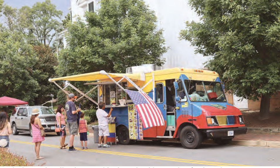
Festival attendees lined up outside the Colombian Station food truck.