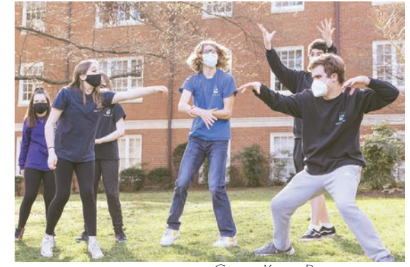
New summer camp safety precautions are combining heat safety with COVID-19 safety.

As temperatures rise, so does camp counselor heat safety training and a focus on sun protection supplies like hats and sunscreen.