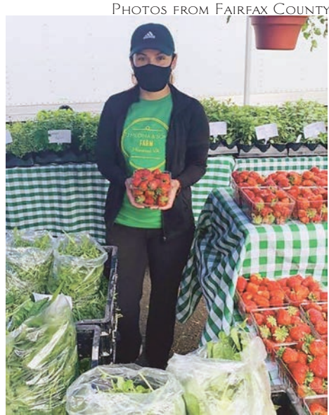
Strawberries come in from all over, such as Medina and Sons farm in Montross, Va.

This year, the county is experimenting with table scrap recycling (composting) at three of the markets, Herndon, McCutcheon