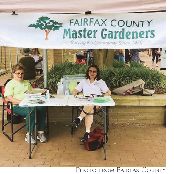
The Master Gardeners are at markets, sharing tips on growing plants and setting up the home garden.