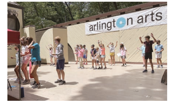
Safety measures, such as those put in place at Encore Stage & Studio in Arlington, are a response to rising temperatures and COVID-19.