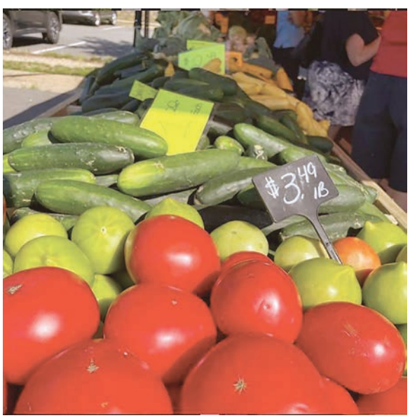
Tomatoes are available about mid summer.

The Farmers Market Coalition is a nonprofit whose mission is strengthening farmers markets across the country so they can serve the community while providing in-