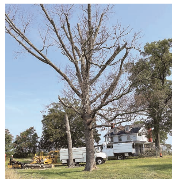
Contractors removed three dead Oak trees which fronted the historic Barrett House on Lorton Road. The property is being readied to enter Fairfax County's Resident-Curator Program.