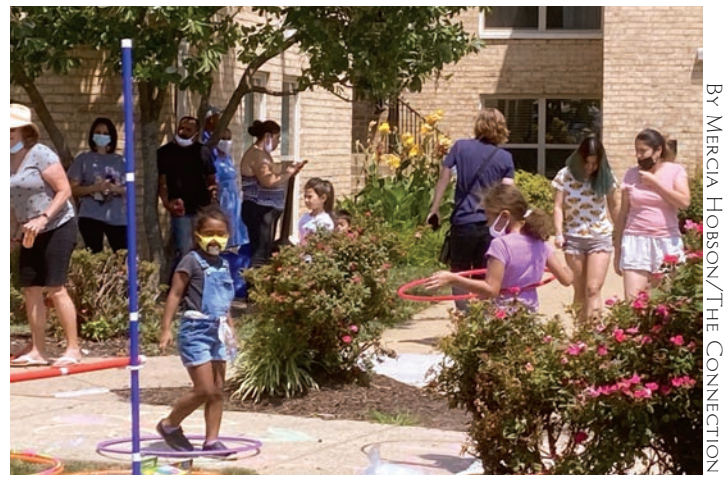
Masks are the norm.