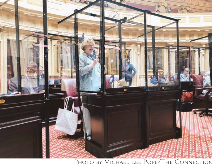
Senate Finance and Appropriations Chairwoman Janet Howell oversaw the massive spending bill in the Senate, where senators appropriated more than $4 billion in federal stimulus money.

Lawmakers are also spending $700 million get rid of anyone," to expand access to broadband internet; $312 "Get your money, and 4 VIENNA/OAKTON / MCLEAN CONNECTION & AUGUST II-17, 2021