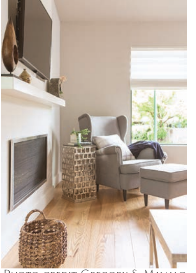
A cozy throw can add an element of warmth to an interior space