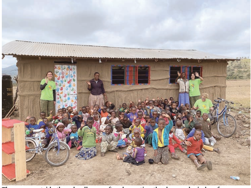
The group outside the schoolhouse after decorating the door and window frames.