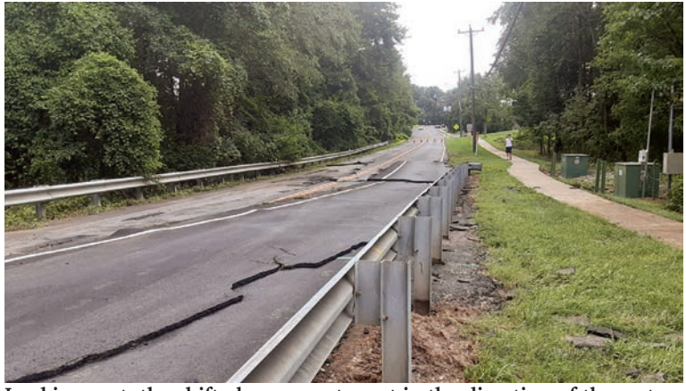
Looking east, the shifted pavement went in the direction of the water.

The social media feed for the www.ConnectionNewspapers.com