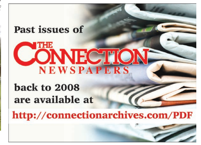
Burke / Fairfax / Fairfax Station/Clifton/Lorton / Springfield 🗞 August 19-25, 2021 🔅 5

In case an alternate date is needed, the meeting will be held Thursday, September 9, 2021 at the same time.