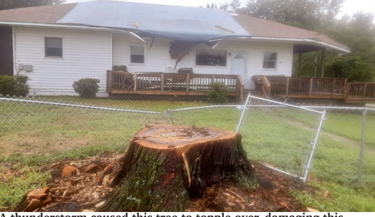
A thunderstorm caused this tree to topple over, damaging this house in Franconia.

near normal. It was the coolest July since 2018, and the average temperature was 80.7 degrees. The total precipitation was 98 percent of normal and the NWS said it was the driest July since 2016, when only 3.13 inches of precipitation fell. A record warm low temperature of 78 degrees was set July 12th. This broke the old record of 77 last set in 2017.