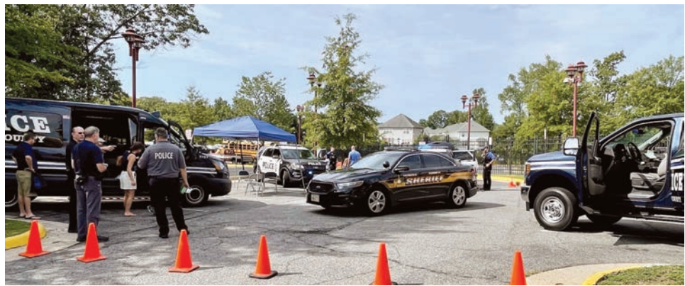
West Springfield Police Station's parking area was filled with a child's delight of police vehicles, lights flashing and sirens sounding, to give a look at the world of law enforcement.