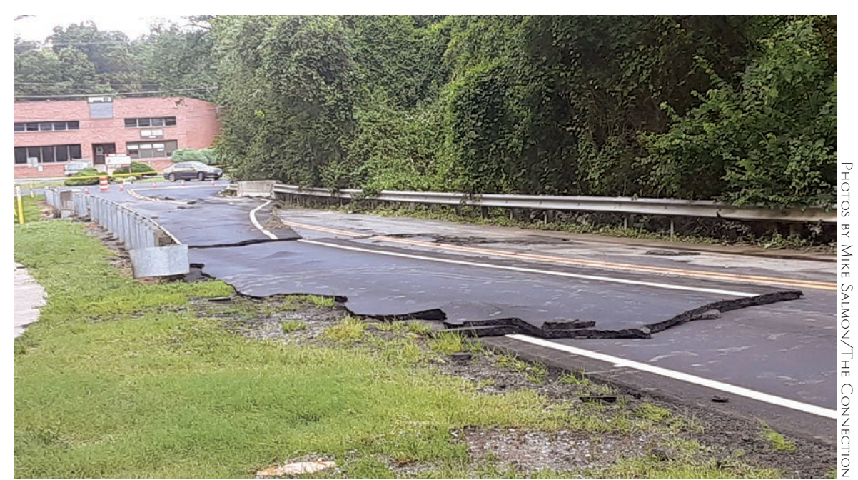
Water overflowed the banks of Long Branch and damaged newly-paved Newington Road.