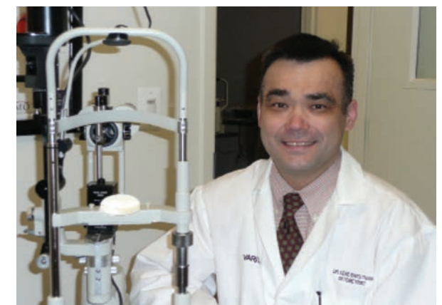
Family & Pediatric Vision Care Comprehensive Eye Exams • Treatment of Eye Diseases US Navy Veteran with 21 years of service Laser Vision Consultants • Over a thousand frames in stock We examine and fit all major brands of contacts including Rigid Gas Permeable, Hybrid and other specialty lenses.

Most Insurances Accepted: Anthem, CareFirst, Medicare, Tricare, Cigna, Aetna, VSP Network Doctor, EyeMed, United Healthcare, GEHA, Virginia Medicaid and many more WE WELCOME YOUR DOCTOR'S PRESCRIPTION