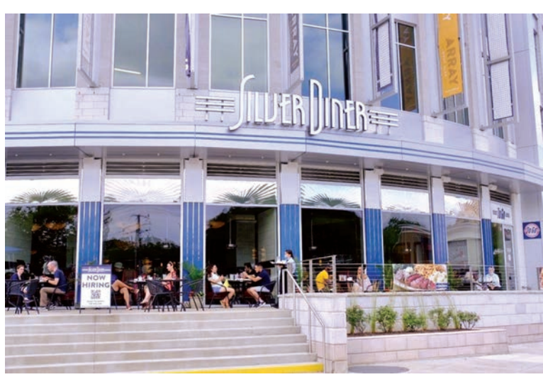
Honorable mention: Silver Diner - West End.

"We appreciate the recognition from the Beautification Commission and our neighbors, who have voiced how the parklets have been a great addition to their neighborhood."