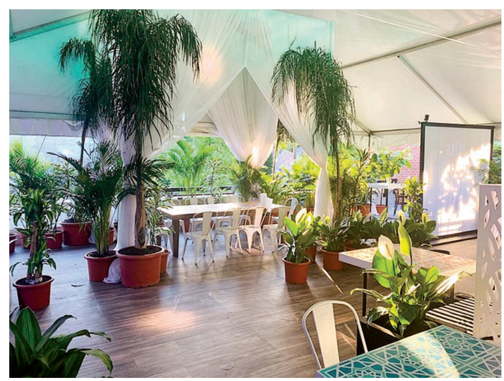
Lena's Oasis, located on top of the Lena's Wood-Fired Pizza & Tap parking deck.