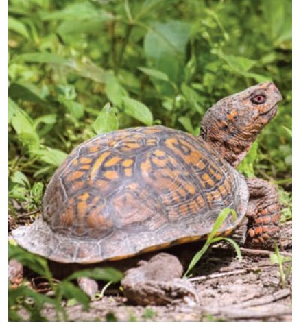
Woodland Box Turtle.

Under a new Virginia regulation, it is unlawful to possess more than one native or naturalized reptile or amphibian per address; collect native or naturalized reptiles or amphibians on public lands, including roads and other publicly-owned properties; and possess any rep-