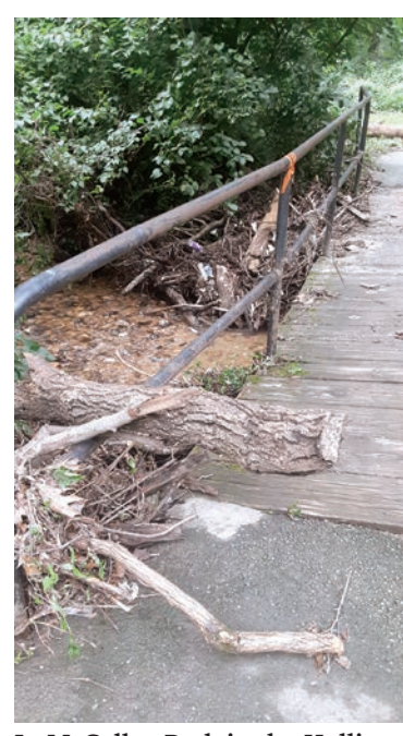
In McCalley Park in the Hollin Hills area, the flooded stream carried debris that impacted a foot bridge.

"When there is heavy rain over a short time period, the impacts are a lot higher," Geiger said. For this storm, there was a "flash flooding