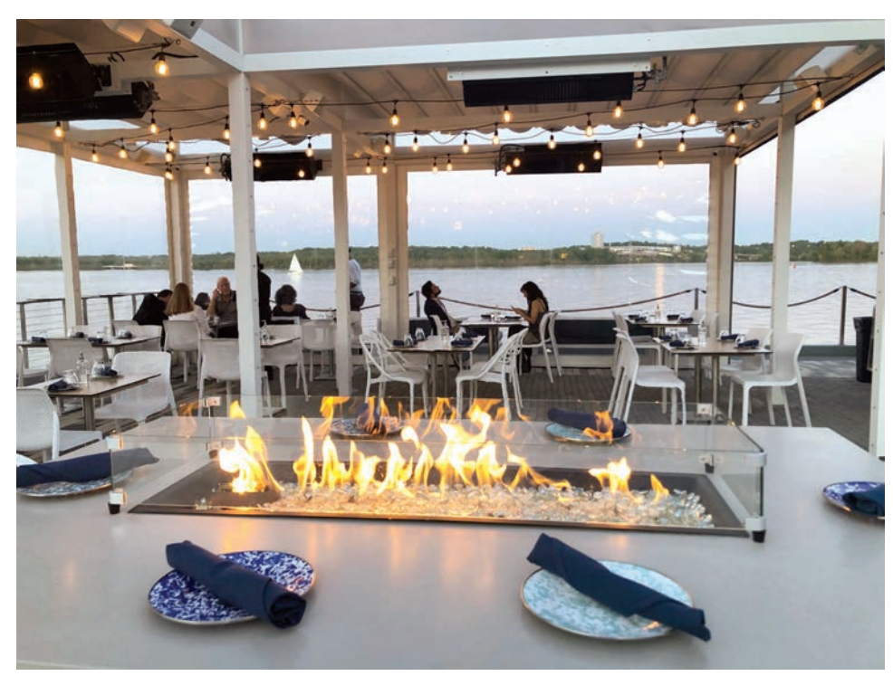
Barca Pier and Wine Bar also offers dock service. Pull up to Robinson Landing to be assisted by the Robinson Landing dockmaster, for an hourly fee.