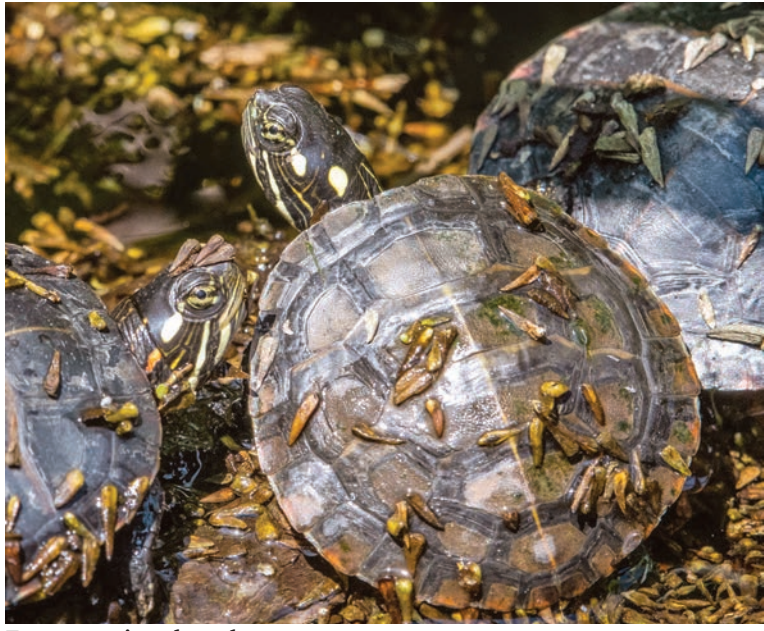
Eastern painted turtle.

eared sliders have been sold widely in pet stores in many states and most populations originated from pet turtles that were released or escaped. Although they are now considered naturalized in Virginia, red-eared sliders may displace or outcompete native turtle species for food, nesting and basking sites."