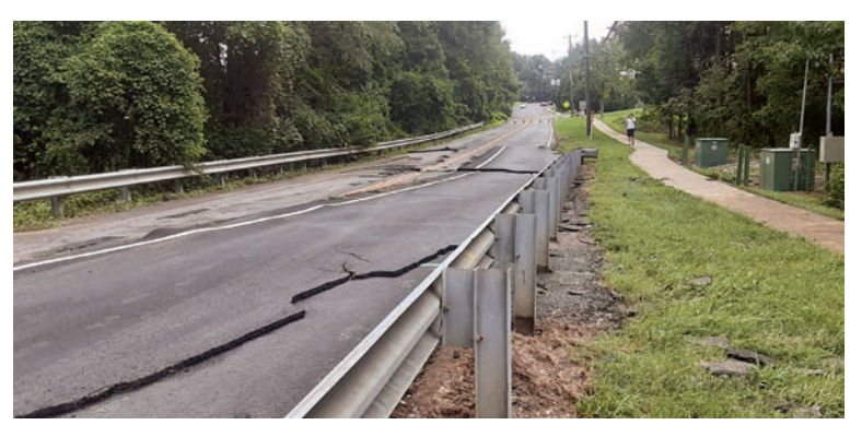
Looking east, the shifted pavement went in the direction of the water.