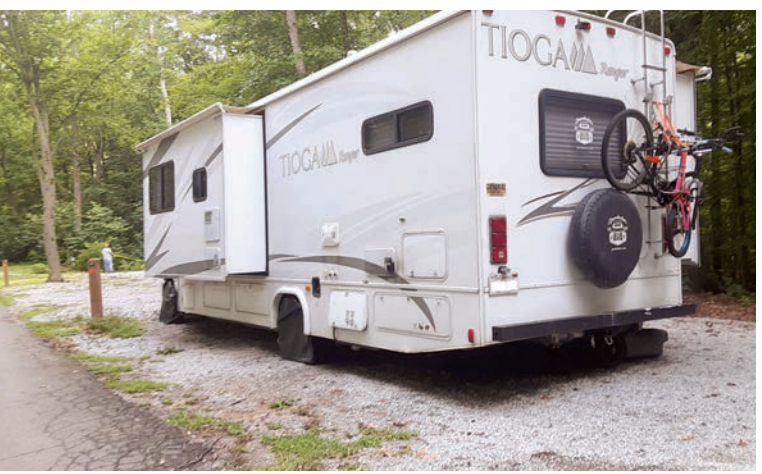
This RV was from California.

On occasion some campers may become a little loud after quiet hours. Generally the campground host resolves these behavioral situations, park officials said. Fairfax County Police support the campground operation with routine patrols through the Fairfax County