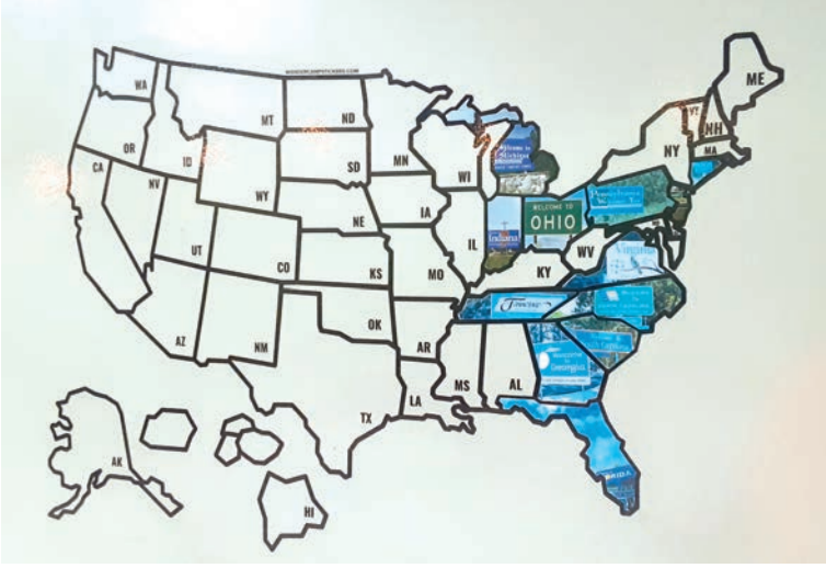
Campers track the states they've visited on a map on the side of the RV.

Pohick Bay Regional Park's family campground features 150 shaded sites -- 100 with electric 50/30amp hookups and 50 tent sites. www.ConnectionNewspapers.com