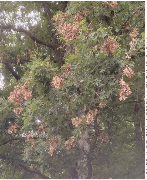
Oak trees with branch dieback, "flagging," possibly harboring oak leaf itch mites as they feed on cicada eggs and larvae.

IN A RANDOM SAMPLE of ten individuals in 2005 in Herndon over two days, six reported near word-for-word complaints. The bites, similar to scores of ones posted and described online, occurred mainly on the Herndon residents' necks, shoulders, upper torsos, arms, 4 MOUNT VERNON GAZETTE AUGUST 19-25. 2021