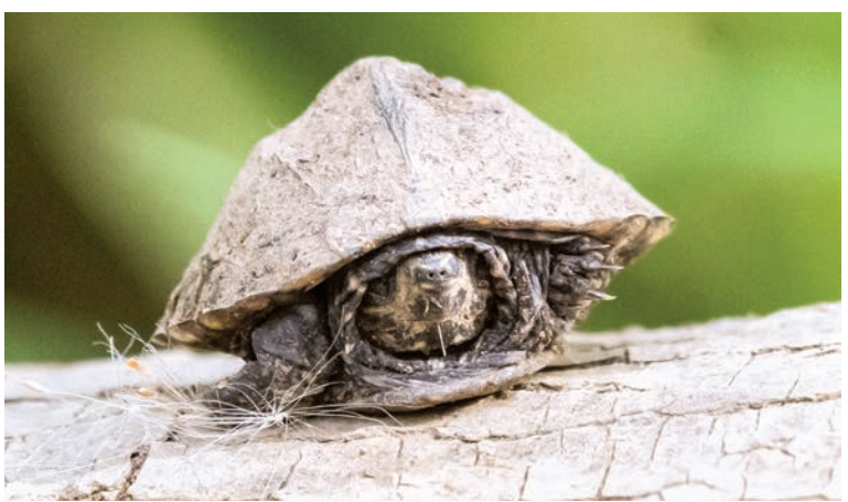
A baby Snapping Turtle - the size of a quarter - at Dyke Marsh.

tiles or amphibians listed as species of greatest conservation need (http://bewildvirginia.org/species/) because they are in decline. These new restrictions apply to many common native reptiles and amphibians such as turtles, garter snakes and bullfrogs.