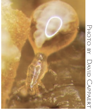
Pin oak leaves.

"Weather associated with spring cold fronts or human or animal migration patterns may have carried the Pyemotes [itch mites] to Illinois from neighboring states,