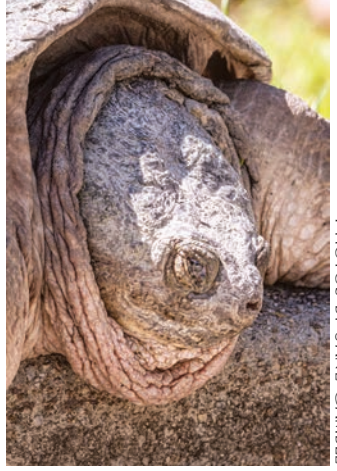
Snapping Turtle at Dyke Marsh.