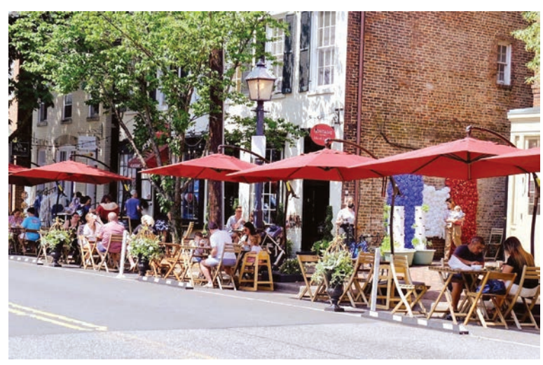
Honorable Mention: Fontaine Caffe and Creperie – Old Town.