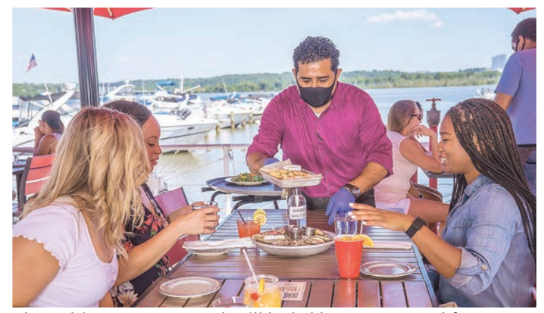
Alexandria Restaurant Week will be held Aug. 20-29 and feature more than 70 restaurants.

Outdoor NSO Strings. 5:30-6:30 p.m. At The Rectory on Princess Street, 711 Princess Street, Alexandria. Musicians from the National Symphony Orchestra celebrate summer. Last Stand Quartet returns to offer a program of stimulating music for string quartet. Then hilarious duo "The String Thing" leads a Guess the Composer Challenge. Test your knowledge of the great works of classical music – and see