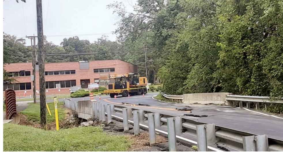
Water overflowed the banks of Long Branch and damaged newly-paved Newington Road. Repairs could take a few days on this valuable transportation link.