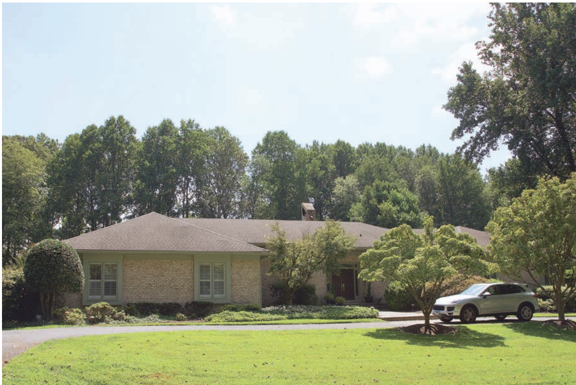
1 11621 Lake Potomac Drive — $1,610,000