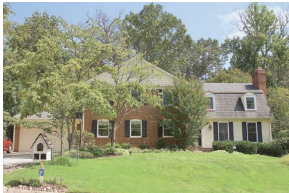
7 7401 River Falls Drive — $1,500,000