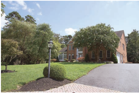
8 8700 SNOWHILL CT