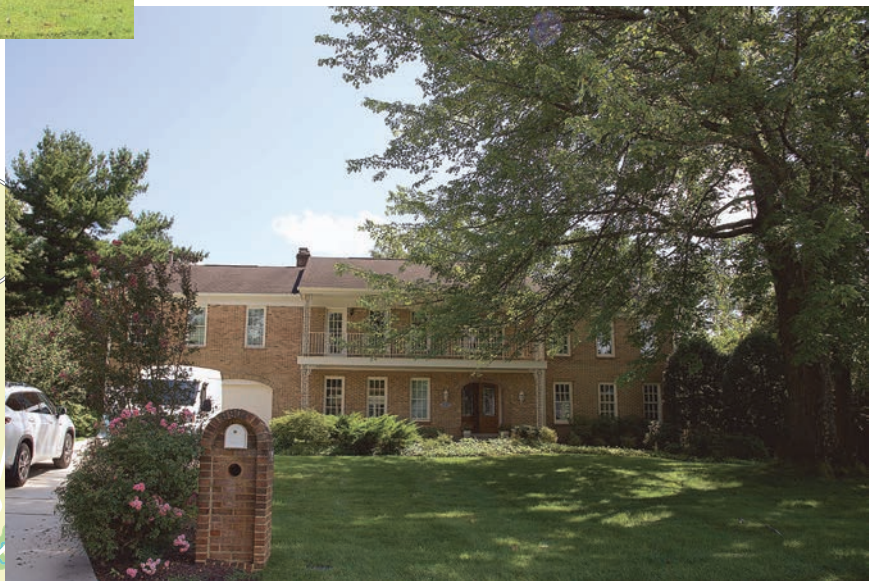
2 9904 Glenolden Drive — $1,577,500