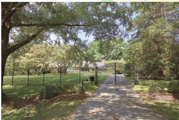
4 11009 Cripplegate Road — $1,500,000

IN JUNE, 2021, 101 POTOMAC HOMES SOLD BETWEEN $3,850,000-$449,000.