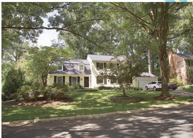
3 7808 Horseshoe Lane — $1,530,000