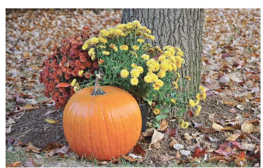
The Harvest Happenings Festival will take place Saturday, Sept. 25, 2021 in McLean.

Note: Capital One Hall Health and Safety Mask & Vaccination Policy: All event attendees regardless of age prior to attending an event at Capital One Hall must provide proof of full vaccination the last dose of which was administered at least 14 days prior to entering Capital One Hall, or a COVID-19 negative test approved by the CDC taken no more than 48 hours before entering Capital One Hall. Proof of vaccination can be your physical vaccine card or a photo of your card. The name on the card must match the name on your photo ID. All attendees, regardless of age or vaccination status, must wear protective masks while inside Capital One Hall except when actively eating or drinking. For details go to www.CapitalOneHall.com