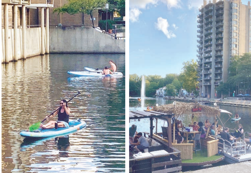
With multiple houseboats full of family and friends at Lake Anne's main dock, paddleboarders on SUPs head toward the remaining space to disembark and enjoy an evening of music.