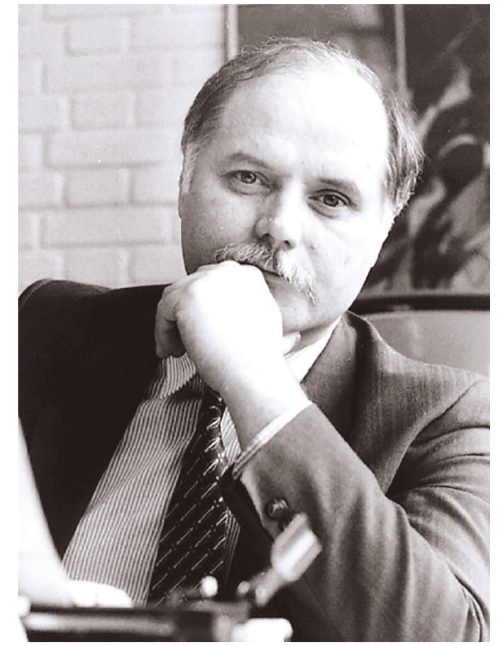
he Legendary editor Kemal Kurspahic died Sept. 17 at the age of 74.