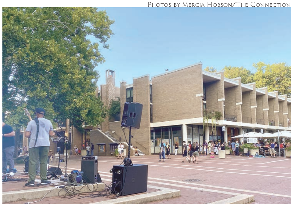
Musicians keep a safe distance while they are on stage. The area in front of the performers remains open, allowing sound to travel, and with little or no seating, people frequent the dining and drinking establishments.