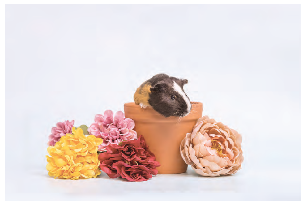
Guinea pigs make great pets and are very popular.