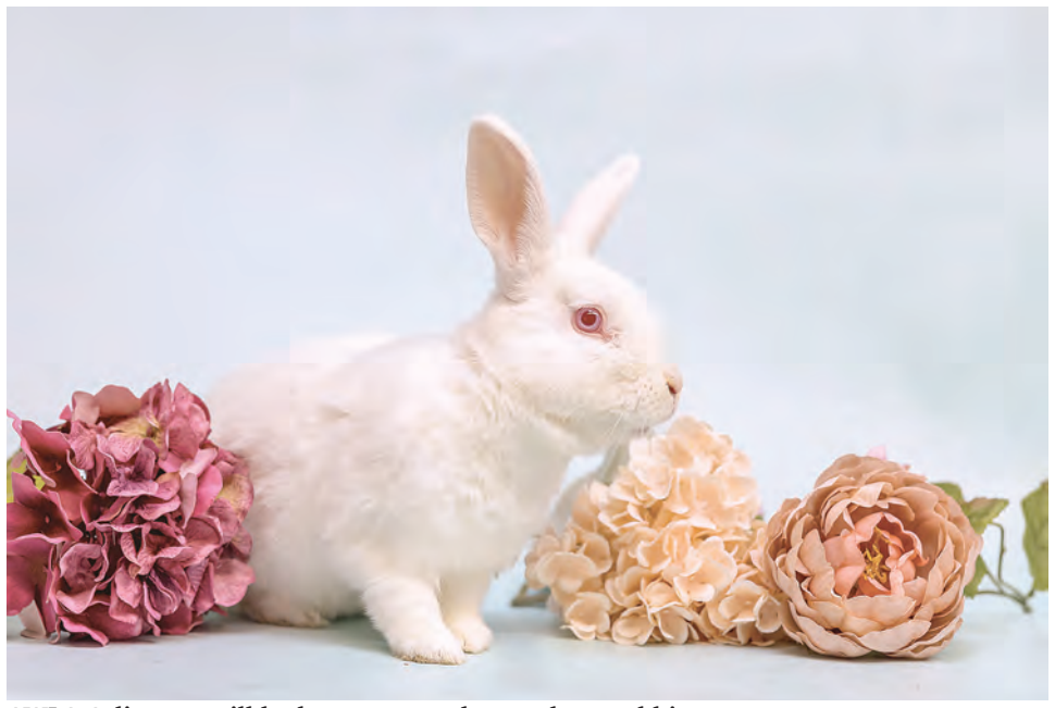
AWLA Arlington will be happy to teach you about rabbits.