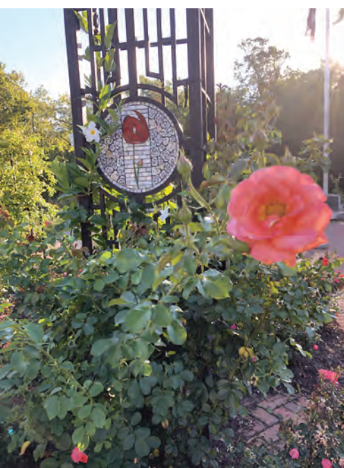
Entrance to the Bon Air Rose Garden.

Silver white winters that melt into springs - you will love the early spring here, especially if you hail