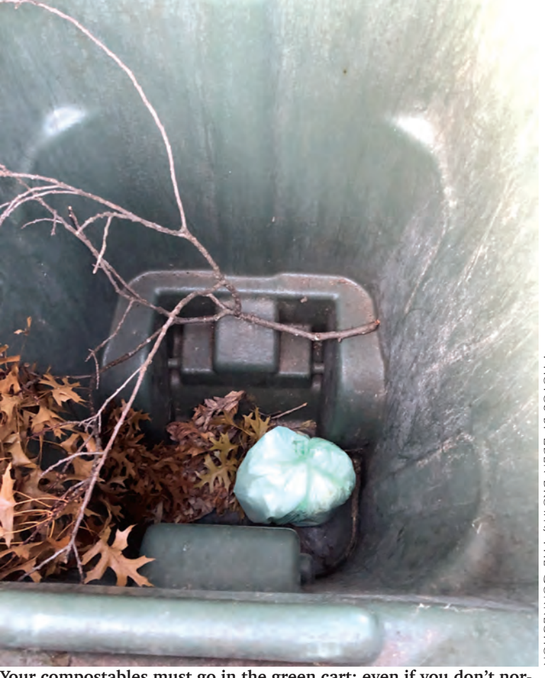
Your compostables must go in the green cart; even if you don't normally put out a green cart, you can throw a few weeds in and put the green bag on top.

6 ❖ Arlington Connection ❖ September 29 - October 5, 2021