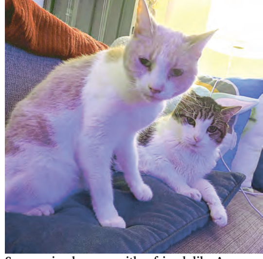
Some animals come with a friend, like Amy and Timothy, who are a super affectionate pair of senior cats

"We are an open–access shelter, which means we are required to