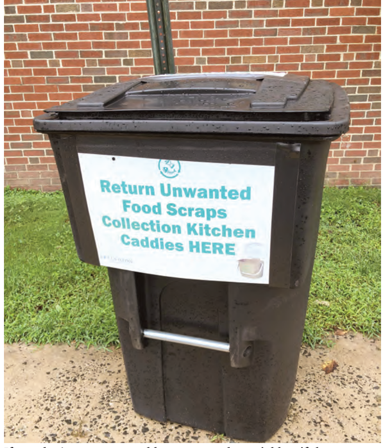
If you don't want your caddy, you can ask a neighbor if they want a second one, or return it in the bins located near you. This one is at the glass collection site behind the Lee Community Center on Lee

ers, which all have white plastic bag recycling boxes. Other flexible plastic materials that can be recycled this way include dry cleaning bags, bread bags, flexible plastic packaging from products such as paper towels, cases of soda, cotton balls, or bathroom tissue; shipping pillows, and sealable or "zippered" plastic food bags.