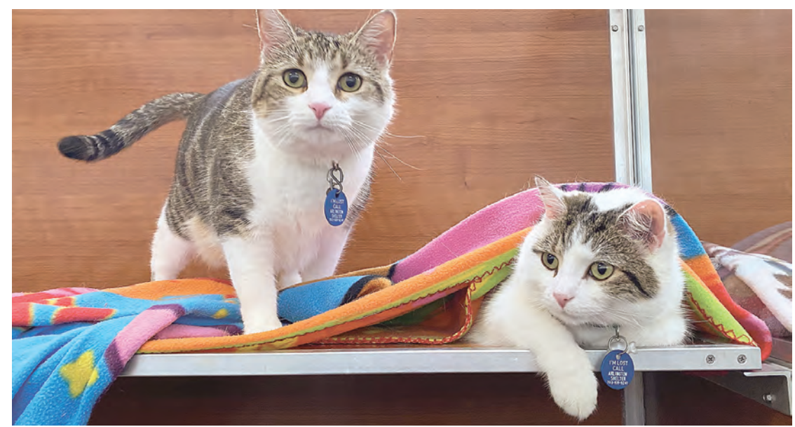
It does make sense to adopt kittens in pairs. They need energetic playmates.