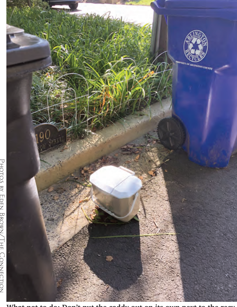
What not to do: Don't put the caddy out on its own next to the recycling. Just place it in the green cart with a branch or two.