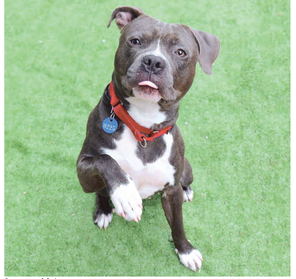
So many tricks!

4 ARLINGTON CONNECTION SEPTEMBER 29 - OCTOBER 5, 2021