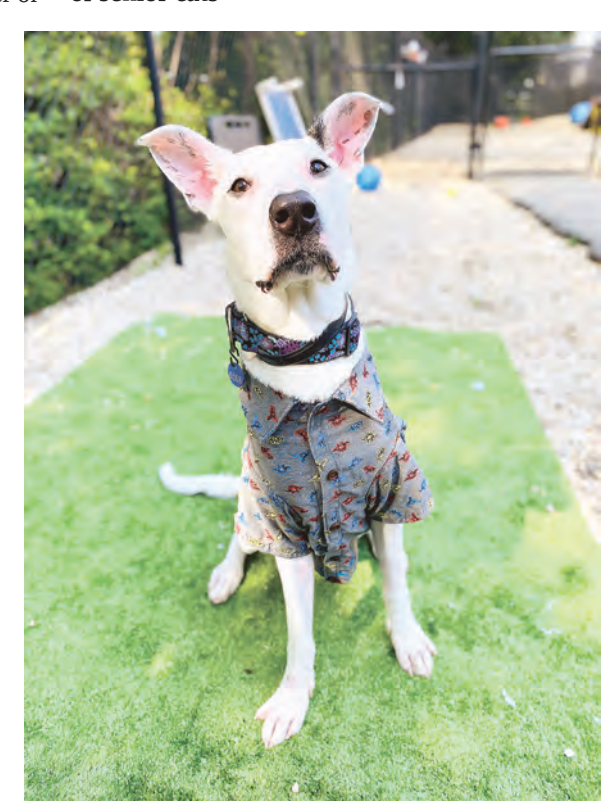
Did you always wish to have a pet who would wear clothes?

4 ARLINGTON CONNECTION SEPTEMBER 29 - OCTOBER 5, 2021