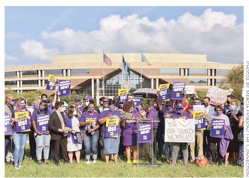
Rallying for Collective Bargaining in front of the Fairfax County Government Center.

"In fact, absolutely nothing about this proposed ordinance directly impacts FCPS in any way. If schools enter into an agreement,