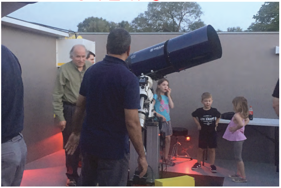
A visitor to Observatory Park at Turner Farm enjoys use of one of the large telescopes.