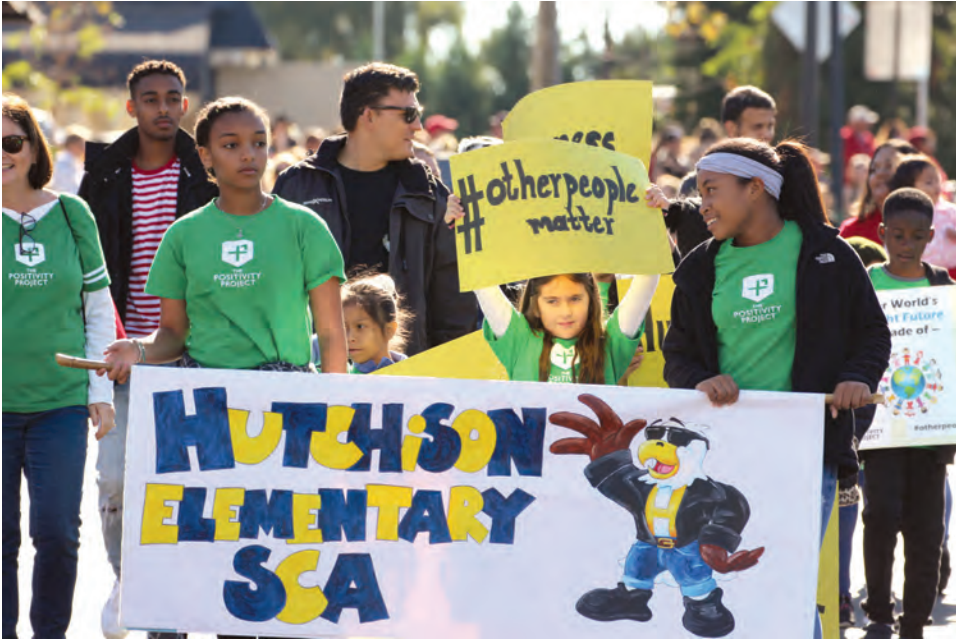
The Herndon Homecoming Parade will take place on Saturday, Oct. 16, 2021 in Herndon.

Art & Craft Festival. Friday, Oct 15: noon – 5 p.m.; Saturday Oct 16: 10 a.m. – 5 p.m.; Sunday Oct 17: 10 a.m. -4 p.m. At Dulles Expo Center, 4320 Chantilly Shopping Center, Chantilly. The Capital Art & Craft Festival at Dulles Expo Center features artisans of glass, jewelry, leather, paintings, prints, photography, pottery, wearable art and wood, plus specialty food exhibition. Cost: $10, in advance; $12 at door; Kids under 12 free, senior discount. Visit the website: www.