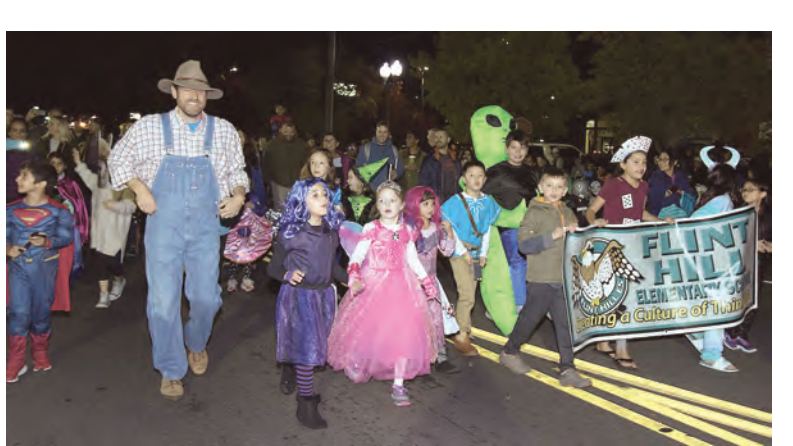
A 75-year tradition, the Vienna Halloween Parade is Oct. 27. This year's theme is the "Roaring 20s."

The Old Firehouse is transforming the inside of the center into the spookiest, scariest, walk-through experience in McLean. The House of Terror will be divided into two time slots: