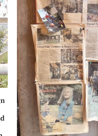
Krop's Crops pays homage to local news. Or is it the other way around?