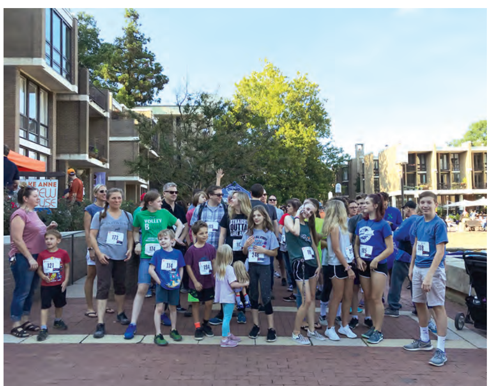
And they're off! Ready to walk Lake Anne Plaza and pick up their donut half-way through the grueling 650-step 0.5k