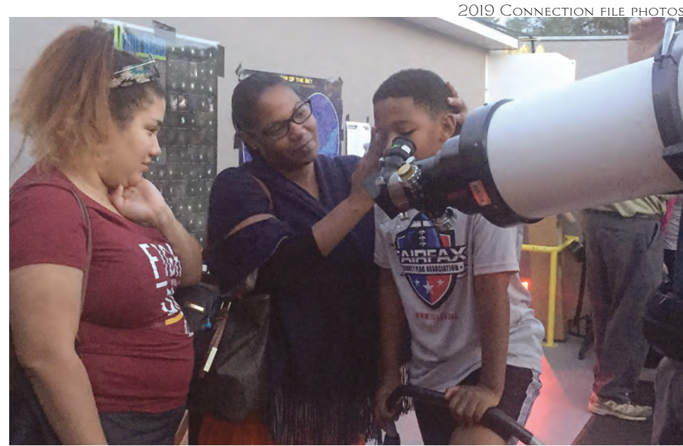
A family takes turns seeing objects in the night sky through one of the large tele scopes at Observatory Park at Turner Farm.