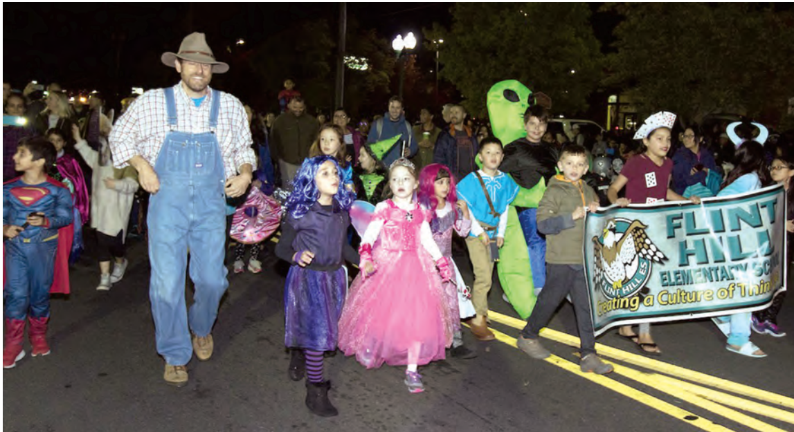
A 75-year tradition, the Vienna Halloween Parade is Oct. 27. This year's theme is the "Roaring 20s."

FIELDS OF FEAR Not recommended for children under 12 years old. When night falls on the farm, it's time for Fields of Fear. Friday and Saturday nights until Nov. 3. Fields of Fear, the Dark Side Hayride and the Cornnightmare. The Firegrounds feature several bonfires, a six-lane slide, music, karaoke, entertainment, tasty treats, Foamhenge, and more. All under age 14 must be accompanied by a parent or guardian