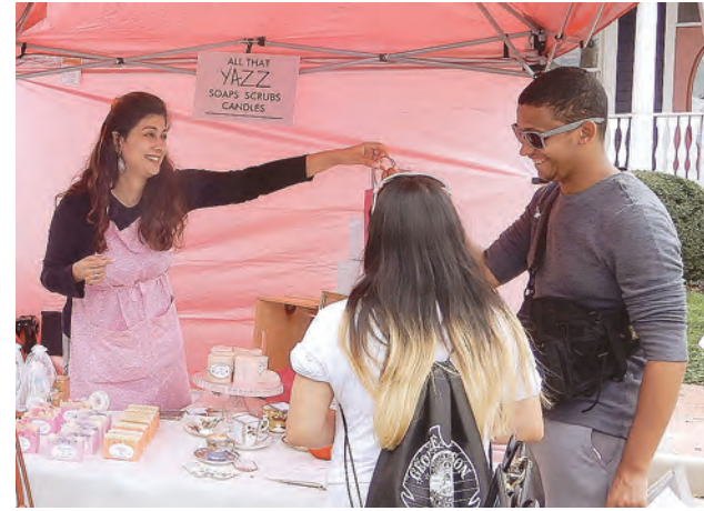
Thousands of people thronged to the festival.

The 45th annual Fairfax Fall Festival was Saturday, Oct. 9.