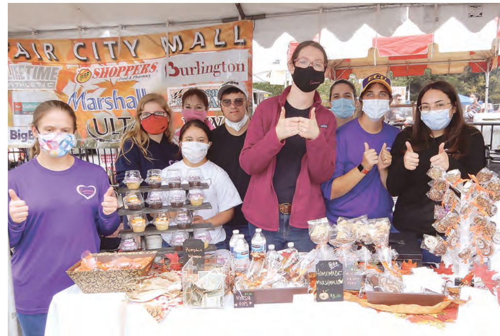
Cameron's Coffee & Chocolates staff selling a variety of tasty treats.