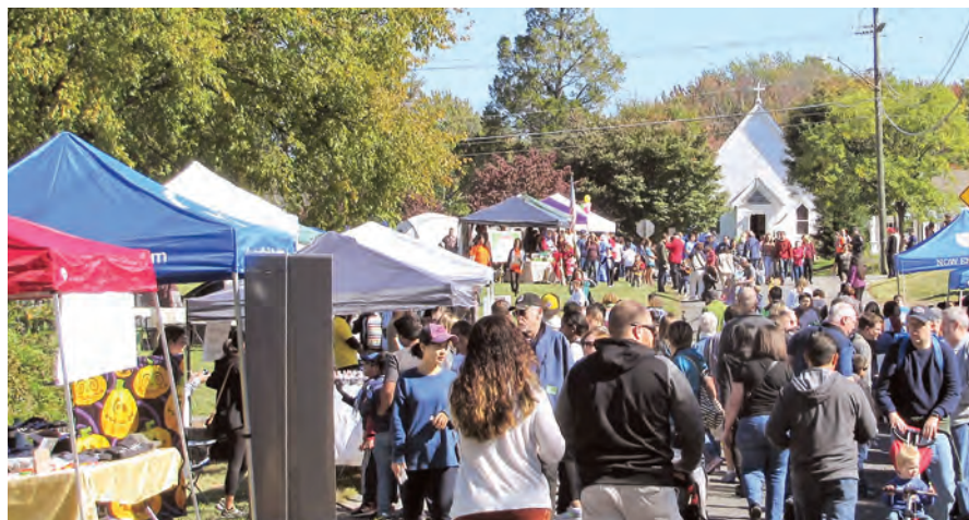
Centreville Day 2021 will be held Saturday, Oct. 16, 2021 in Centreville's Historic District.

Centreville Day 2021. 10 a.m. to 5 p.m. At Centreville Park, Braddock and Mt. Gilead Roads, Centreville. Entertainment, food, crafts, vendors, historic locations, parade, children's rides and games, Cavalcade of Pets, Safety Expo. Great day for families. Spaces still available for vendors and sponsorships. Satellite parking will be available in the Carrabba's (Rt. 29) parking lot beginning at 9 a.m. and ending with last pickup at the Braddock stop at 5 p.m. Overflow available if needed in Trinity Centre. Shuttle buses provided by Fairfax County Community and Neighbor-