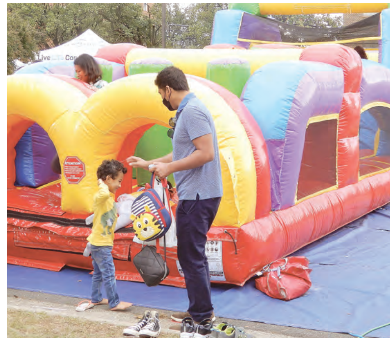
This dad greets his son, who just emerged from the moonbounce.