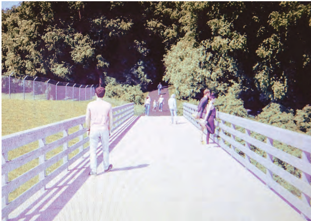
Artist’s rendition of the proposed boardwalk