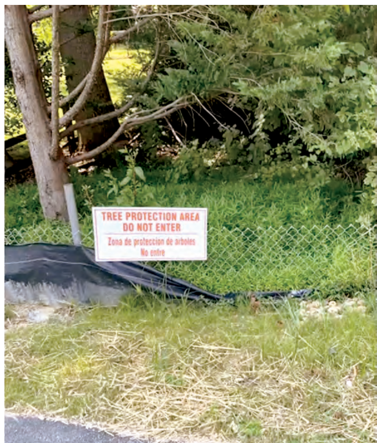
Tree canopy protection as viewed on the video Infill & Tree Canopy Forum on Oct. 19.