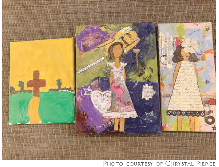
Creating art is one of the ways that Chrystal Pierce and her friends stay connected.

ists, but they use art as a way of maintaining their call these friends and they would tell me that it