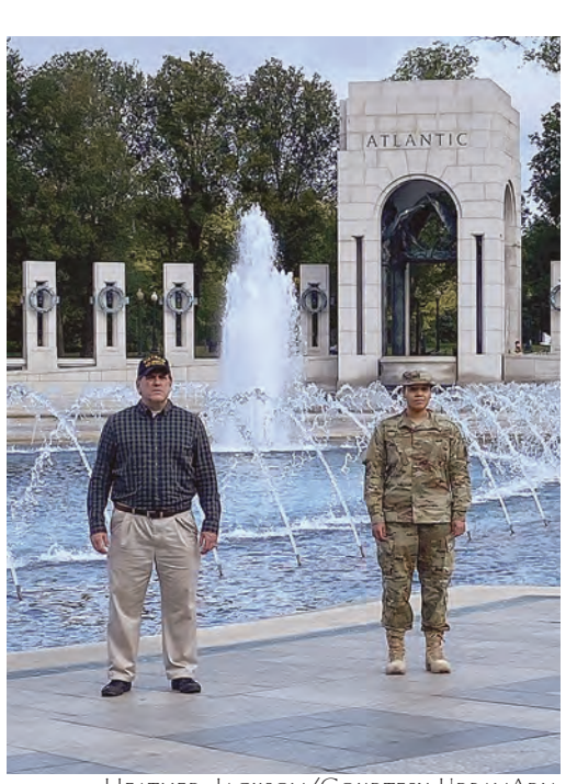
From filming of "UNKNOWN" cast on location at World War II Memorial

For composer Okpebholo, "UNKNOWN" is expansive in its presentation and outlook. "UNKNOWN is not just a White American story. 'Unknown' looks like America. It reflects musically the diversity of those who www.ConnectionNewspapers.com