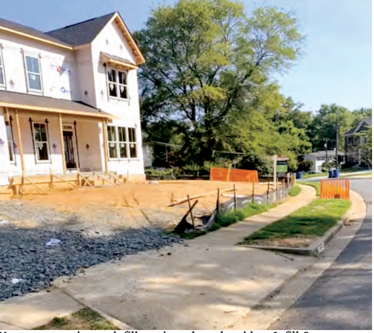
New construction as infill as viewed on the video Infill & Tree Canopy Forum on Oct. 19.

McGlone said there are only two primary county codes for infill development and trees. The Fairfax County tree conservation ordinance is the discretionary authority that is only available to Northern Virginia communities.