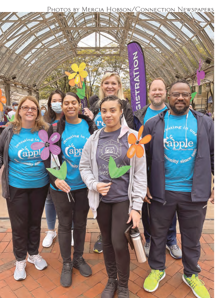
"Alzheimer's is something that affects a member of my family."