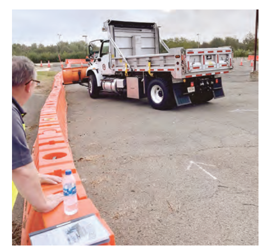
Heavy equipment operator Alwine takes the snow plow into the difficult right curve.