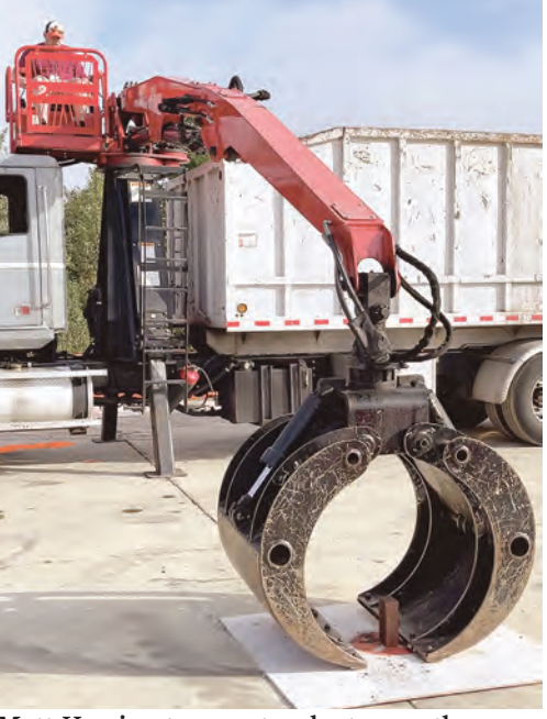
Matt Harris, stormwater dept. uses the knuckleboom to pluck a brick and move it to the target circle on the opposite side of the truck.

"The day is a chance to show skills with the day off from normal work duties," said FCPS