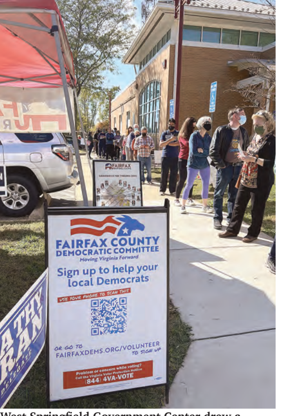
West Springfield Government Center drew a steady line of early voters on Oct. 23 & 24