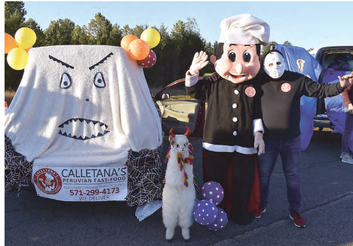
Calletana's Peruvian Fast Food included a llama in its display.