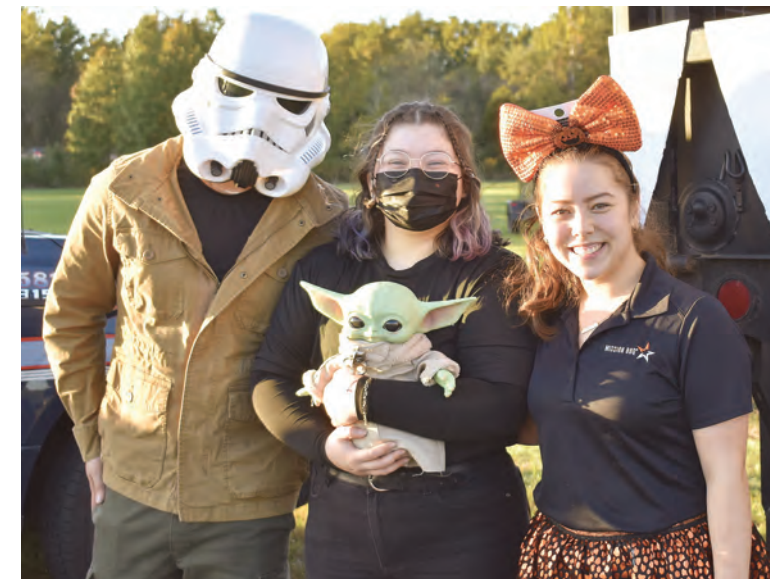
Mission BBQ employees brought Baby Yoda to the festivities.