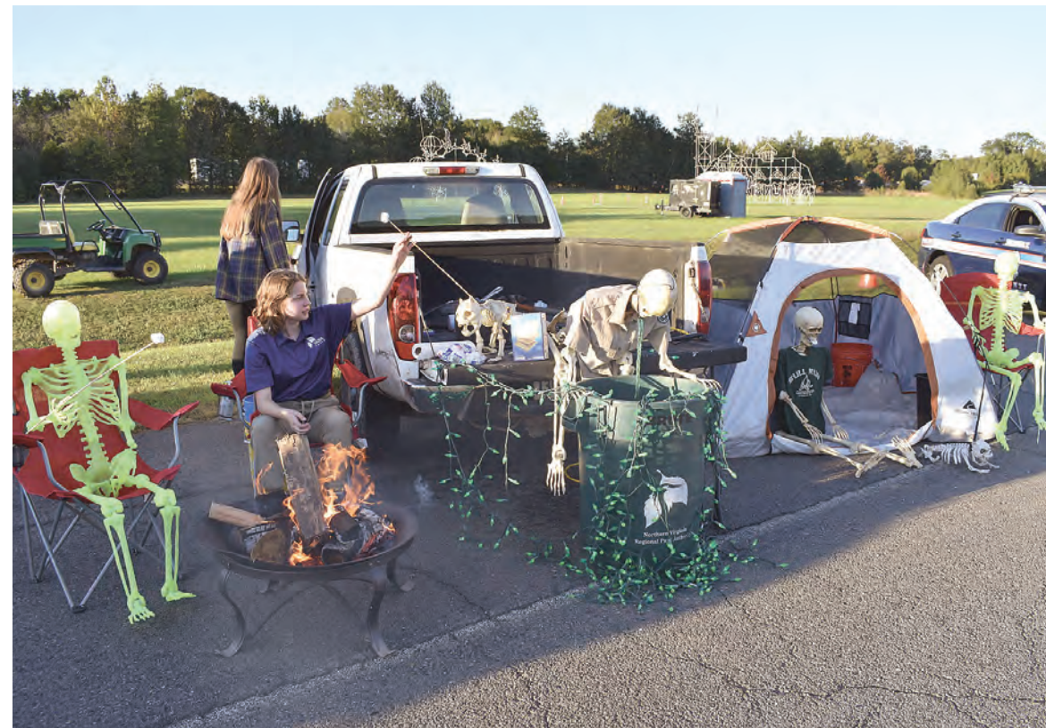
NOVA Parks' display features skeletons on a campout.