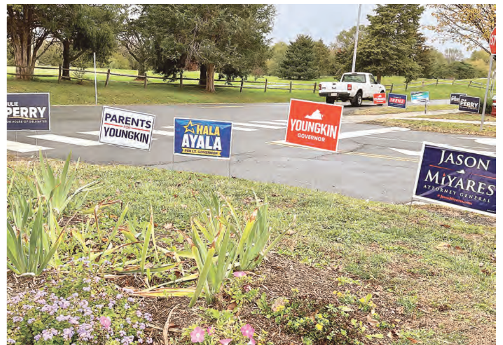
Political signs in front of Herndon Community Center.