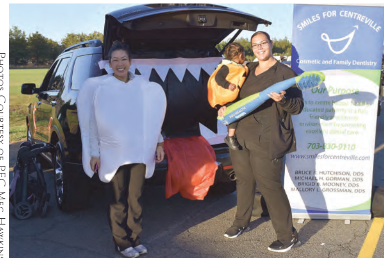
Employees from Smiles for Centreville get into the spirit of the event.