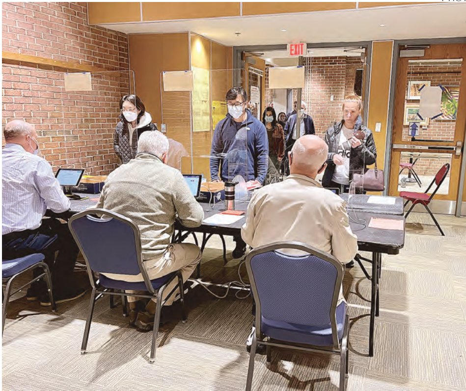
People line up to vote in Vienna.