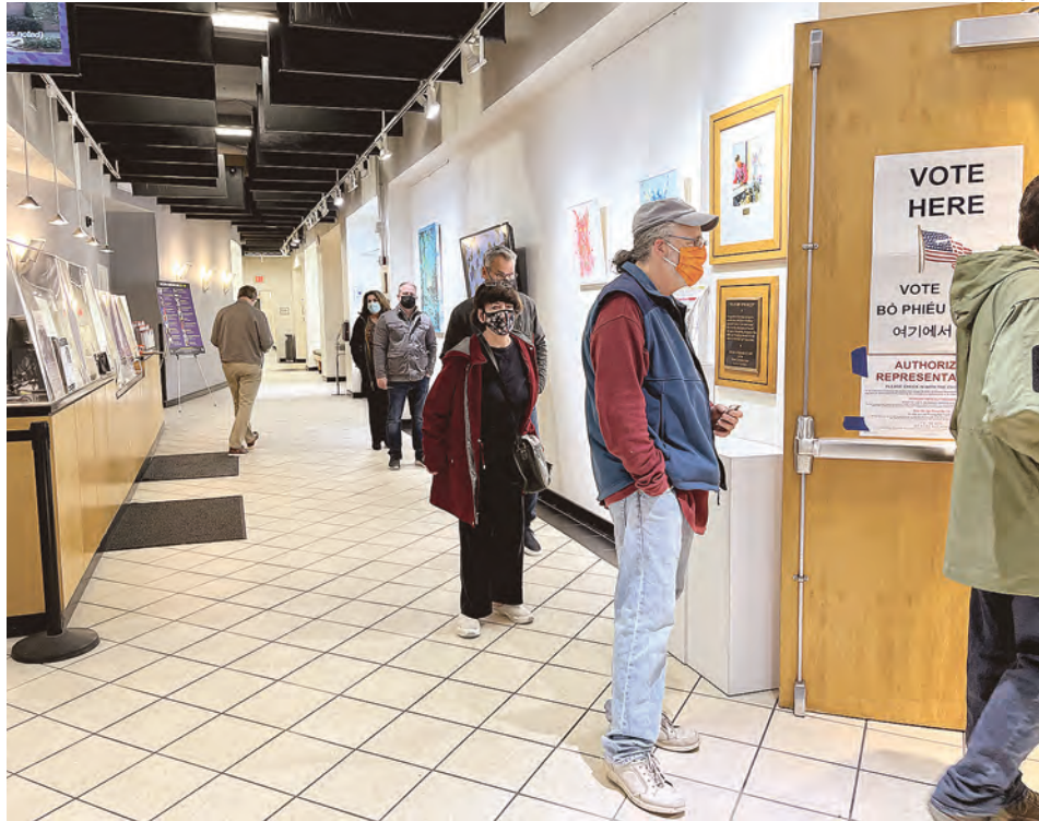
The 6 a.m. voting line at Reston Community Center on Nov. 3.