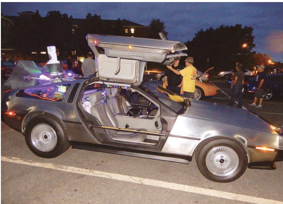
This flashy vehicle is a replica of the DeLorean from the movie, "Back to the Future."