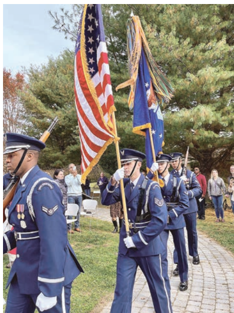
An Air Force Color Guard enters the grounds of the Great Falls Freedom Memorial on Veterans Day.

But no matter which of the Veterans Day ceremonies one attended, there were similarities: the impressive postings of the nation’s colors, veterans and guests reciting the pledge of allegiance, and choral groups singing the national anthem and other patriotic songs. Speakers acknowledged the veterans who stood between us and ever-present danger.