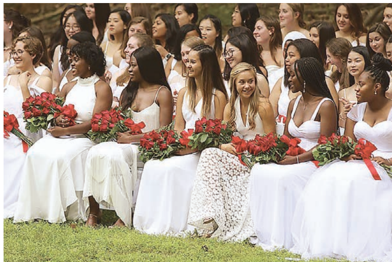
A private school graduation from before the pandemic.

Still Ross believes that dedication and determination can increase the chances of being accepted to the school of your choice. “My best advice would be to stay the course and acknowledge the investment you’re