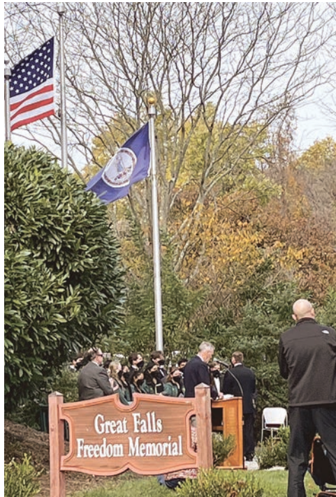
The Langley Madrigals