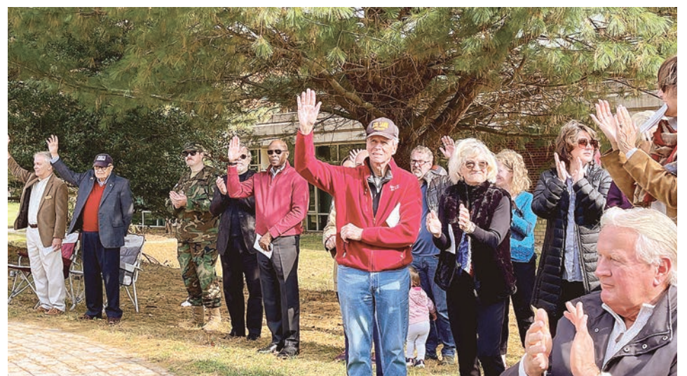
Veterans identify themselves by a raise of hands.