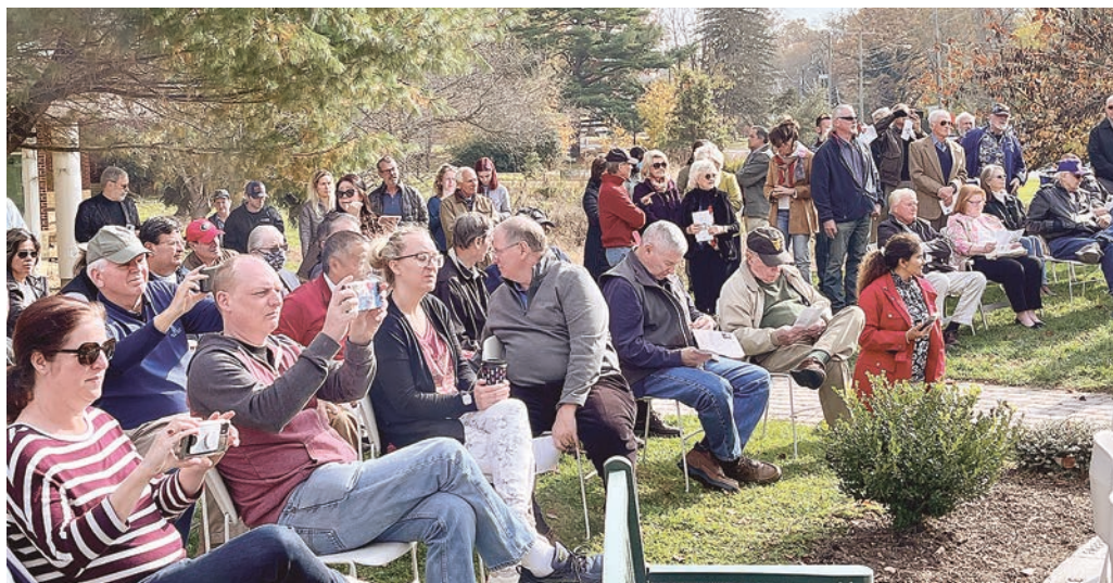
It was standing room only at the Veterans Day Ceremony in Great Falls.