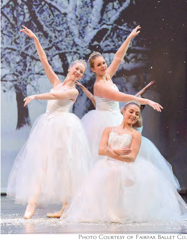
Fairfax Ballet performers dancing the Waltz of the Snowflakes during a previous show.

Snow, and it's as if everyone is dancing in-