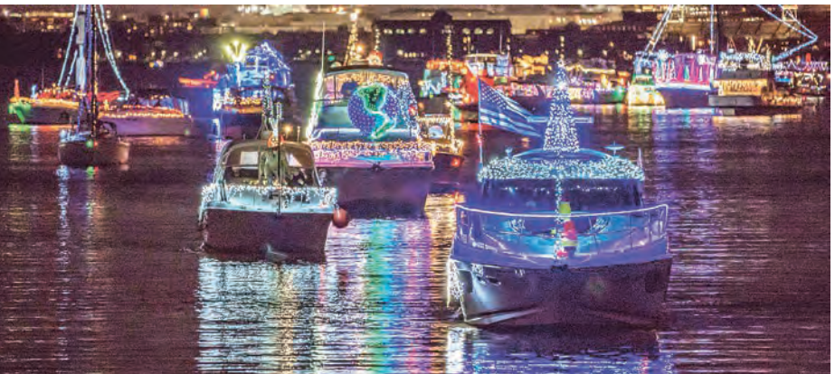
The Alexandria Holiday Boat Parade of Lights will be held Saturday, Dec. 4 in Alexandria.

and Parade. Taste of Scotland: Friday, December 3 at 6:30 p.m. Parade: Saturday, December 4, at 11 a.m. Campagna Center is thrilled to celebrate the 50th Anniversary Scottish Walk Weekend in Alexandria. In 1749, the City of Alexandria was established by Scottish merchants. Dozens of Scottish clans dressed in colorful tartans parade through the streets of Old Town, joined by pipe and drum bands from around the region, as well as terriers and hounds. The weekend kicks off with the Taste of Scotland Scotch Tasting on Friday evening in the Atrium Building. The parade will depart from St. Asaph St. heading north, head east from Queen St., head south from Fairfax St., and head west from