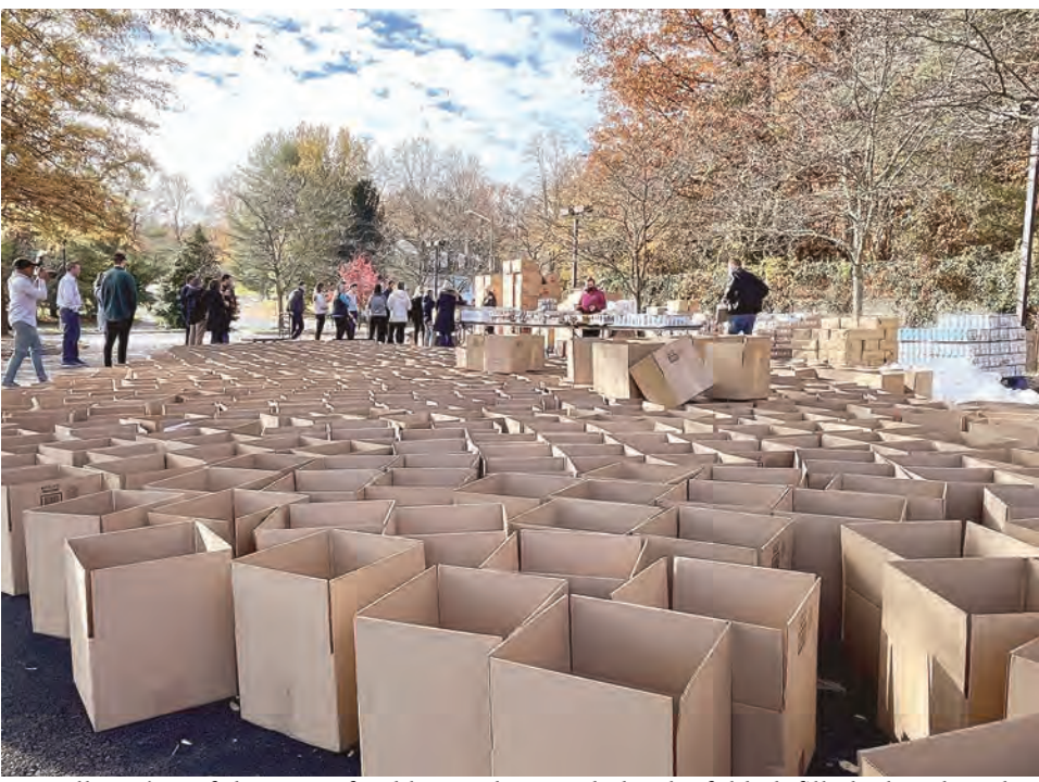
A small section of the 1,500 food boxes that needed to be folded, filled, closed, and stored ready for distribution on Saturday.