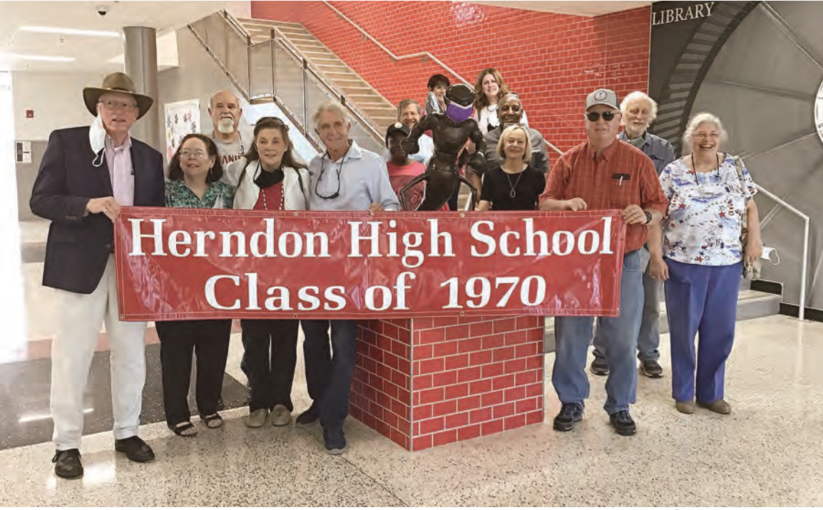
Members of the Herndon High School Class of 1970 gather at the school for a tour on the occasion of their "50 + 1" Reunion.