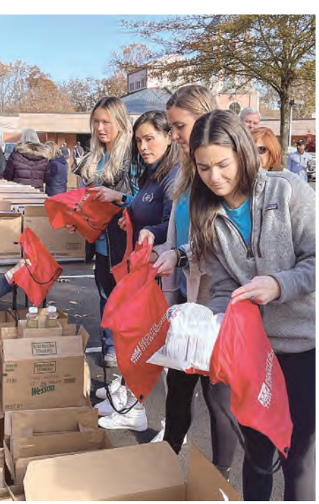
Volunteers pack chips and oil as part of